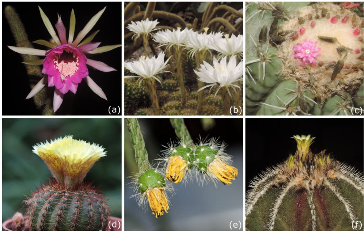
PLATE 2 Some of the threatened species in the Rio de Janeiro Botanic Garden Cactarium (Plate 1): (a) Arthroocereus rondonianus, (b) Echinopsis calochlora, (c) Melocactus glaucescens, (d) Parodia ottonis, (e) Rhipsalis pilocarpa, (f) Uebelmannia pectinifera.