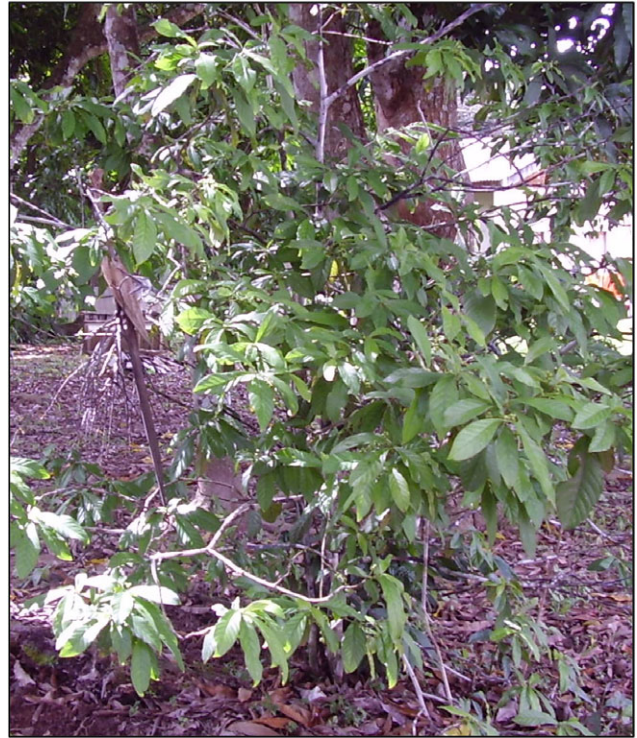
Figure 3. Psychotria viridis .