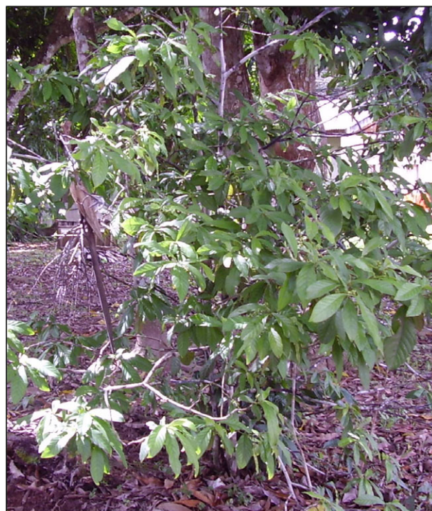
Figure 3. Psychotria viridis .