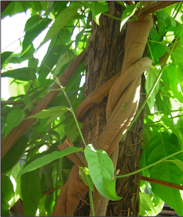
Figure 1. Banisteriopsis caapi .