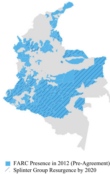
FIGURE 2. Mapping splinter group emergence in former FARC territory