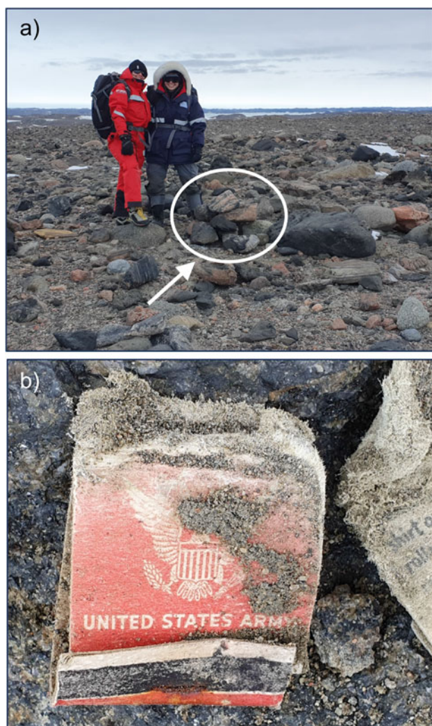
Fig. 2. a. Marie Weber (left) and Amber Howard (right) stand beside a cairn four rocks tall, under which two matchbooks were buried. The cairn (circled) lies between the people and the dark boulder at the right. The view is to the south across the broad hill summit (image: 20240228_185134.jpg). b. Detail of the front of the red matchbook. The sand obscuring the top of the book was frozen on and could not be removed without damaging the artefact (image: 20240228_184623.jpg).

potential for damage. The matchbooks were photographed and returned to the soil and the cairn reconstructed. Web searches, particularly of scientific literature and images of matchbooks, were conducted to help determine further history of the artefacts and of visits to Thomas Island.