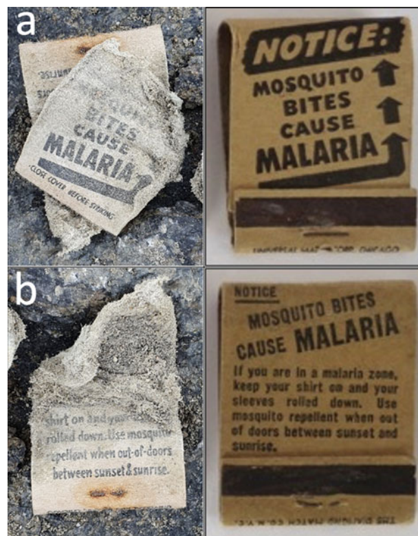
Fig. 3. a. Front side of the grey matchbook found on Thomas Island (image: 20240228_184637.jpg) compared with the front side of a World War II-era 10-in-one United States Army ration pack matchbook (source: https://www.kration.info/cigarettes-and-matches.html ). b. Rear side of the grey matchbook from Thomas Island (image: 20240228_184612.jpg) compared with the rear side of a World War II-era 10-in-one United States Army ration pack matchbook (source: https://www.kration.info/cigarettes-and-matches.html ).

The rock cairn was on the broad, glacial debris-mantled summit of one of the highest hills on Thomas Island (Fig. 2a), at ~114 m above sea level as recorded by handheld GPS (similar to the 109 m noted in SAE et al. 1966). There was no exposed bedrock or other form of formal survey marker there. The location at 66.10597 S, 100.90063 E is not presently in a Historic Sites and Monuments, Antarctic Specially Protected Area or Antarctic Specially Managed Area. The cairn is nearly 21 km north-east of the Australian Edgeworth David summer base and 20 km north-north-east of the Russian Oasis-Polish Dobrowolski