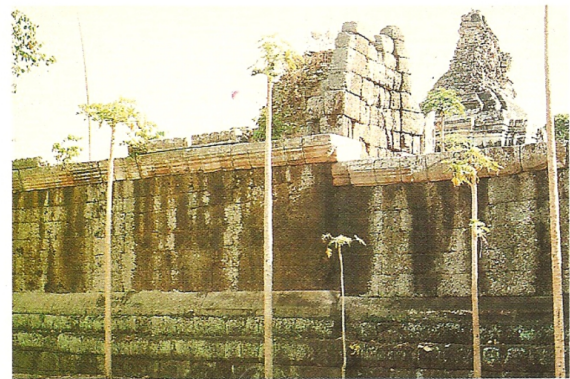
Angkor-era Khmer temple at Phnom Chisor, Takeo province, Cambodia. Photo: Ben Kiernan, 1988.

Now, in their JVS article published in 2014, High and two co-authors cite precisely that paragraph of ours. 19 But they neither quote from it nor reveal to readers the fact that in it – in 2010 – we had publicly revised our estimate back downward, and acknowledged their assistance in doing so. Instead, in 2014, incomprehensibly, they create the exact opposite impression: "Owen and Kiernan's revised figure [ sic ] is nearly five times higher than conventional estimates ... Owen and Kiernan's reassessment of the air war over Cambodia has also been uncritically cited by a number of other scholars... The idea that Cambodia was the victim of 2.7 million tons of ordnance, rather than 0.5 million, is becoming the "new normal" in Cambodian studies. This upward revision has serious implications for the reading of regional, military and global history." 20