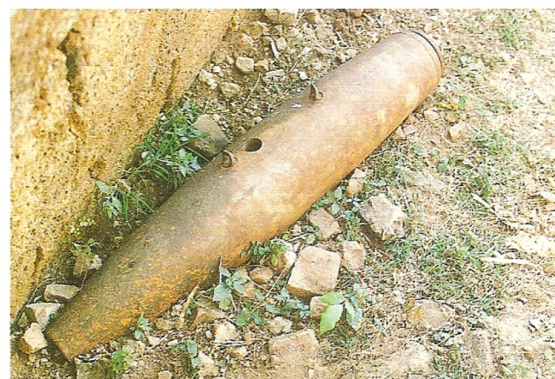
In 1988, farmers at Phnom Chisor pointed to an unexploded U.S. bomb still lying where it had fallen in 1973.

This is a valuable insight into the nature of the database and the thoughtful analysis that High, Curran and Robinson have conducted. But it is simply a window into the process. We do not have access to the details of the process that they used to build their database, nor to the complete database on which they have made these final calculations. Without further information we do not know, for instance, why a zero erroneously added to each bombing load weight could have produced an approximately fivefold tonnage over-estimate (from c. 0.5 to 2.7 million tons), rather than a tenfold error. But we do have here a glimpse into some of the process of the data analysis that it would be valuable to have fully entered into the public record. This would allow us to compare the database they built with the one we used for our analysis, which to the best of our knowledge are similar in structure. To get this important historical analysis right, we ask High and her colleagues to release their database and more fully explain the process by which they created it from the Pentagon’s original files.