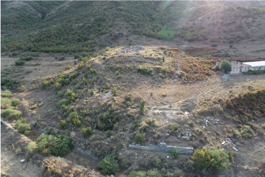
Fig. 7.6. The Hellenistic lower site and the upper and residential complex at Dobra.