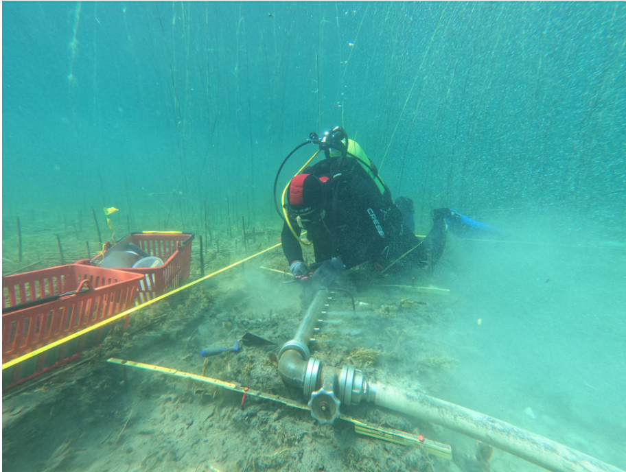
Fig. 7.4. The excavation of the prehistoric lake shore village of Lin 3 on Lake Ochrid.

partially resettled in the fifth/sixth centuries AD. Archaeological excavations undertaken in different sectors intra muros , brought to light important public monuments (Heinzelmann and Muka 2014), while extra-urban investigations revealed the presence of two different funerary areas (Muka and Heinzelmann 2014; 2016; Heinzelmann and Muka 2015; Muka, Heinzelmann and Schröder 2020).