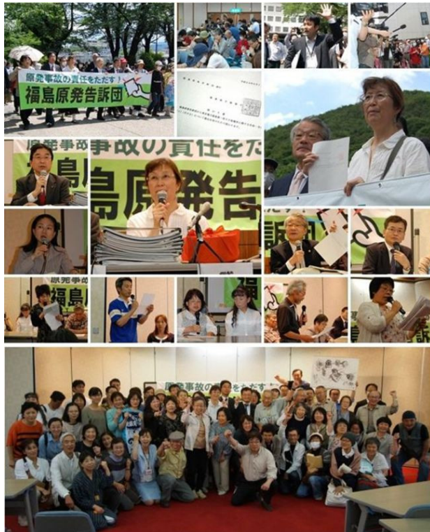
Photos from June 11, 2012, when 1324 residents of Fukushima filed a criminal complaint against 33 TEPCO executives and government officials.

Ultimately, three of them would be indicted, after citizens on two Prosecution Review Commissions overruled the non-charge decisions of Japan's professional prosecutors.