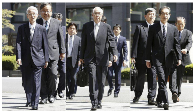
Former TEPCO executives and criminal defendants

In response to the charges of criminal negligence, the defense maintained what TEPCO spokespersons have long insisted: that the company has adhered to the “basic policy of always keeping safety first” (TEPCO, 2012). It also stressed that HERP’s report was unreliable, and that other experts disagreed with its conclusions, especially the Japan Society of Civil Engineers, whose 2002 report had been emphasized by professional prosecutors in their explanations for the non-charge decisions that were subsequently overturned by the Tokyo PRCs. More fundamentally, the defense insisted that a disaster of Fukushima’s magnitude was not “concretely foreseeable,” and it argued that its 5.7-meter (19 foot) sea wall was designed to withstand a tsunami equivalent to the maximum tide level ever recorded on the Fukushima shores. For their part, the three defendants echoed at trial what TEPCO spokespersons had been saying since the 3/11 meltdown: the safeguards they took were sufficient, but they “deeply regretted” the accident that occurred and the trouble it caused to victims and survivors. Many observers found their words hollow and insincere. Apologies of this kind – “I am not causally or legally responsible, but I am sorry” – are common in Japan. One analyst has noted the tendency to “grovel through a ritual of remorse” is so routine that “it’s a running joke” in some parts of Japanese society (West, 2006, p.285).