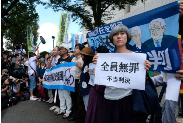
After the TEPCO Trial acquittals on September 19, 2019, a woman outside Tokyo District Court holds up a sign saying “All Acquitted: Inappropriate Judgment.”

The outcome of the TEPCO trial also raises an interesting question: what if the trial had occurred before a lay judge panel of six citizens and three professional judges? This did not happen in the TEPCO case because under Japan’s Lay Judge Law, the only crimes eligible for lay judge trial are those for which the maximum possible punishment is a life sentence or a death sentence (only about 2 percent of Japanese crimes fall into these categories). But what if?