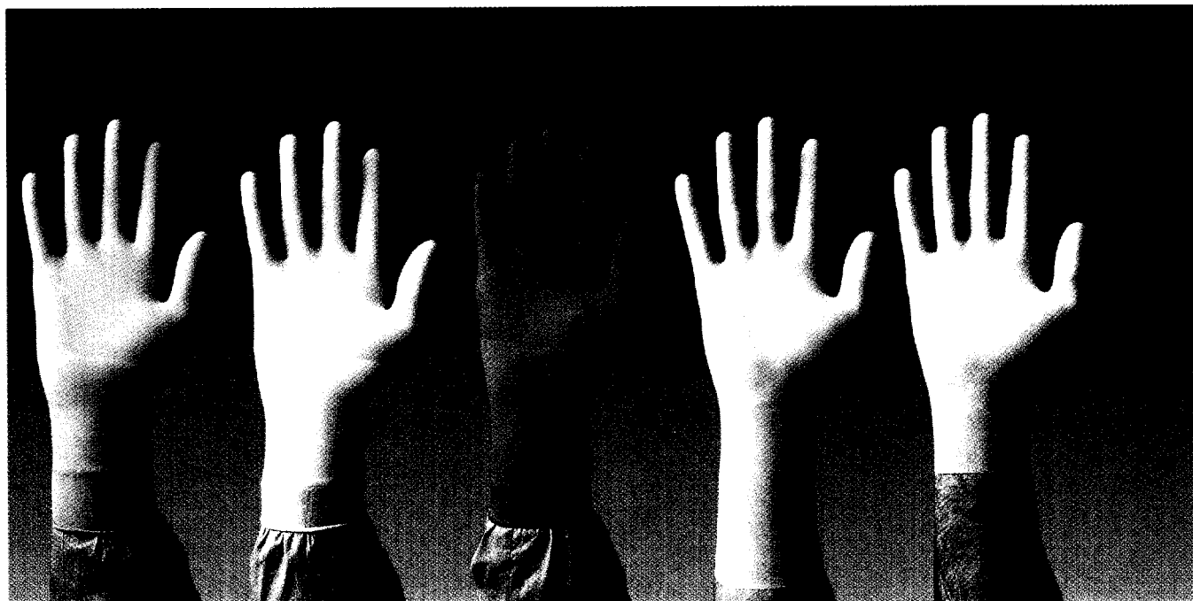
NEUTRALON® Brown Surgical Glove MICRO-TOUCH® Latex Surgical Glove MAXXUS® Orthopaedic Surgical Glove MICRO-TOUCH® XP Latex Medical Glove MICRO-TOUCH® Latex Medical Glove

P rotection. The key to our superior glove line.