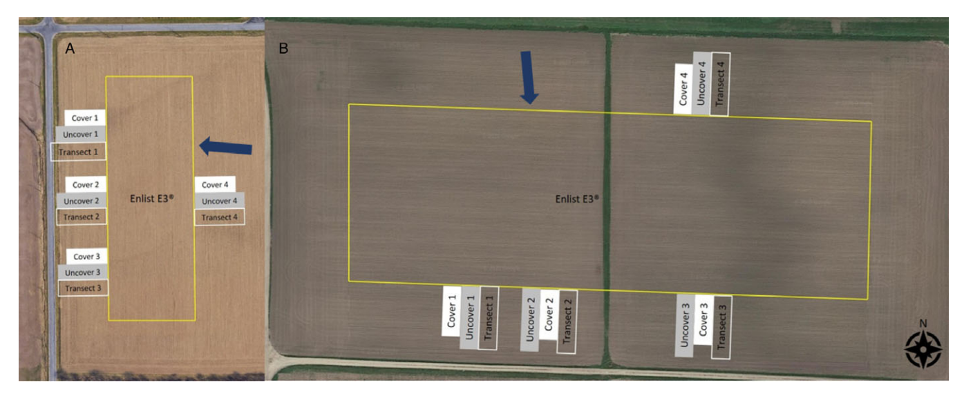
Figure 1. Field plot layout for the experiments conducted at a (A) commercial field near Sun Prairie, WI in 2019 and the (B) Arlington Agricultural Research Station near Arlington, WI, in 2020 to evaluate off-target movement of 2,4-D choline applications in 2,4-D-resistant soybean. Images are not on the same scale. Blue arrows indicate the approximate wind direction at the time of application.

the treated area. For the in-swath assessments, eight and 10 filters were placed throughout the treated area in 2019 and 2020, respectively. Six filters were placed in three downwind transects and one upwind transect at 0.76 m, 1.52 m, 3.05 m, 6.10 m, 11.51 m, and 24.38 m starting from the edge of the treated area (Figure 1). Filter papers were collected 30 min after application, placed in 50-mL centrifuge tubes (Sarstedt AG & CO., Numbrecht, Germany), and transported to -20 C cold storage until overnight shipment for analysis. The upwind filters were collected before downwind filters and filters were collected from the farthest distance from the treated area inward in order to avoid contamination among samples. A separate team of individuals collected in-swath filters to avoid contamination.