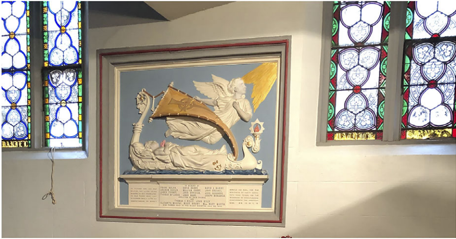
Figure 5. Holy Trinity Church.