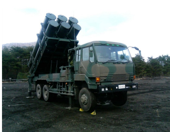
Truck carrying Type 88 missiles. Also known as SSM-1 or Shibasuta, this missile was developed by Mitsubishi Heavy Industries from the Air SDF Type 80 (ASM-1) air-to-surface anti-ship missile. 28

Conclusions. Increasing tensions in Asia make it necessary to examine the different strategies of the actors involved, Japan among them. Most observers hope that some sort of diplomatic settlement will ultimately be reached. In support of such a view they cite factors such as the economic interdependence between the different countries involved, the high costs in material and human terms of an open conflict, and the fact that public opinion indicates ambivalence concerning resort to arms against neighbors. Diplomacy and military might, however, are not two completely unrelated spheres, and a country's weight in the former usually depends to some extent on the capabilities and credibility of the latter. This is why, although rearmament and the development of new military capabilities by Japan's SDF are only one of the legs in Tokyo's strategy to deal with tensions in Asia, defending her national interest while seeking to avoid open conflict, it is necessary to examine moves in this area. This may facilitate a clearer view of Japan's diplomatic options, as well as the perceptions by her neighbors, including