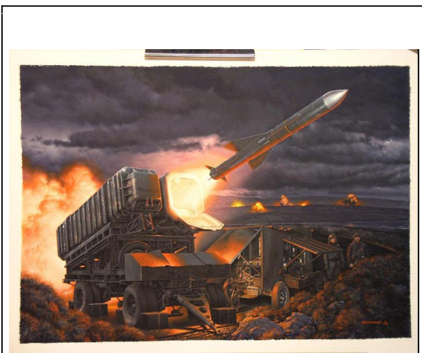
Artistic rendering of the launch of an Exocet by the ITB. 29

Among others, Tokyo is trying to reinforce economic and political relations with a wide range of actors. These include ASEAN member states, India, and Mongolia, just to mention a few. Prime Minister Abe Shinzo also seems to attach great importance to improved relations with Russia, and this is matched by a corresponding interest by Russian leader Putin. It is reinforced by both countries' needs for energy trade diversification, Russia as exporter and Japan as developer and importer. Moscow and Tokyo show how territorial disputes and historical mistrust are not necessarily an obstacle to better relations, when the political will and economic incentives are there on both sides. Japan has also been quick to assist the Philippines recover from Typhoon Haiyan / Yolanda, in a move made the more important since it is one of the countries that Imperial Japan occupied during the Second World War. On the trade front, while facing a number of obstacles, Tokyo is one of the actors clearly interested in a successful outcome to the Trans-Pacific Partnership (TPP) negotiations.