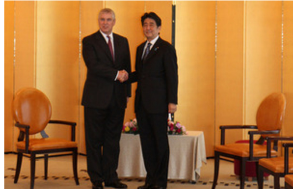
Abe's coded message to Beijing: shaking hands with Falklands veteran, His Royal Highness the Duke of York. 30

The 400th anniversary of UK-Japan relations seems to be providing cover for Japan's deterrence diplomacy. Next year, the 100 anniversary of the First World War, where Japan and the UK fought together, may provide further opportunities for the Japanese prime minister to send subtle messages to China and to Tokyo's allies. In his keynote address at the RUSI conference, Abe noted how the Japanese Imperial Navy came to be known as "the guardian of the Mediterranean". Can Japan combine a no-nonsense approach to national security without incurring excessive military spending and/or prompting accusations of militarism at home and abroad? That is a key question, and one on which the Japanese Government seems to be looking to the UK as a possible role model, or at least recalling the heydays of the Anglo-Japanese Alliance at the dawn of the twentieth century, when Japan was widely respected as a regional power without being seen as an outcast and a bully as in the 1930s. One of the main challenges is selling this to South Korea, a country clearly reluctant to see Tokyo play a stronger role in international, and particularly security, affairs.