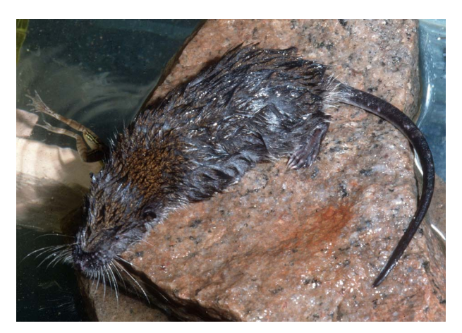
PLATE 1 The aquatic tenrec Microgale mergulus is categorized as Vulnerable because of its restricted number of known sites (10) and limited area of occupancy (< 2,000 km<sup>2</sup>). © P.J. Stephenson.

All threatened tenrec species are known from only a few individuals captured at 10 or fewer locations, making it hard to determine accurately their distribution, abundance, habitat preferences, or population trends. There have been few ecological studies and little information exists on tenrec behaviour. Few Malagasy protected areas have monitoring schemes in place. In addition, tenrec taxonomy is changing regularly as a result of ongoing genetic analyses and