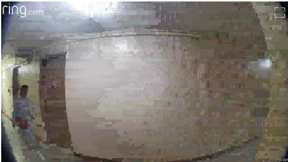
Figure 2. A corrupted video shows someone approaching before it goes blank. Still from “Ring Damage” (Neighbor 2023) from the Neighbors app.