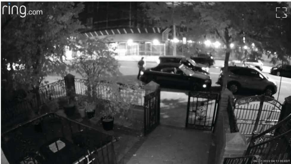
Figure 5. People who make deliveries are often imaged by Ring cameras and posted on Neighbors. Still from “Suspicious activity” (Neighbor 2022c) from the Neighbors app. (Screenshot by Talley Murphy)

without compensating you; it just argues that you are better off inside its ideological matrix than outside it—that it will protect you by protecting your property. Your gestures recruit you into the maintenance (social, financial) of capitalist surveillance, and the surveillance scene you support estranges you so it can relocate you inside its grasp. For actors to produce a Verfremdungseffekt , Brecht proposes “not - but,” a logic in which “every sentence and every gesture signifies a decision” while still showing the alternative as a possibility implied in that decision ([1951] 2014:213). With a threatening not - but , Neighbors teaches: you are not the criminal, but both the victim and the cop. You are not the criminal, but you could be, and your potential criminality remains “contained and conserved” in your gestures, your sentences, your decisions (213). You must decide, again and again, with every gesture, to play the role of both victim and cop and to report or turn in strangers to ensure that you will not become a criminal, too.