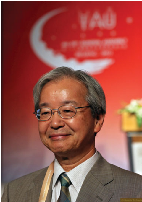
Norio Kaifu 2012–2015