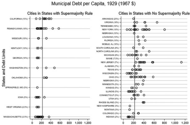
Figure 1. Cities’ 1929 real debt per capita, by state debt limits and supermajority debt approval requirements. Note: Hollow circles indicate individual cities in our 213-city sample and show within-state dispersion of real per capita debt in 1929. States are listed in the order of strictness of debt limit as a percentage of assessed value. Two cities in our sample (Springfield, MO and Mobile, AL) have debt limits that differ from their state’s general limit and are shown separately. Vertical lines indicate median per capita debt in 1929 across the full 213-city sample.

limits themselves range from 2 percent of assessed value (Indiana) to 25 percent (Arkansas). Ten states in the sample had supermajority voting requirements for the approval of debt. Low and high debt limits existed in both supermajority and non-supermajority states, which suggests that these policies were independently determined. Two features of the data are worthy of note. First, cities with higher debt limits tended to hold more debt in 1929. This outcome holds in both supermajority and non-supermajority states. Second, cities in supermajority states generally had low levels of per capita debt in 1929: only 29 percent of the cities in our sample in states with supermajority debt rules had per capita debt values above the median value (indicated by the vertical line), while 63 percent of cities in non-supermajority states had debt levels above the median value.