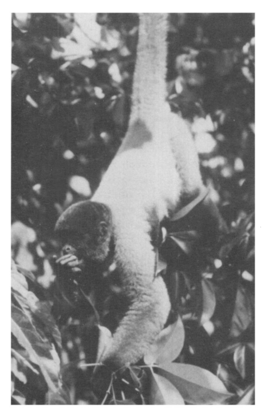
Sub-adult female Lagothrix lagotricha cana feeding on fruits in the canopy of a non-hunted terra firme site.