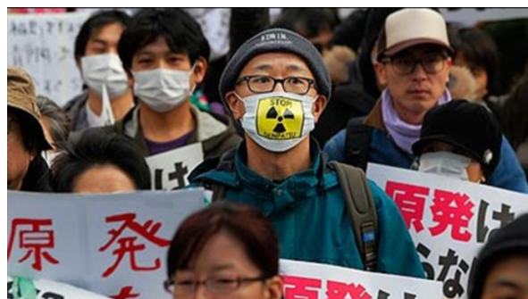
Protestors demonstrated against nuclear power in Tokyo on Sunday, as officials admitted the crisis at the Fukushima Daiichi nuclear plant could take 'months or years' to be resolved.