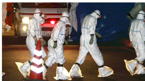
Radiation protective uniforms but not boots. Two TEPCO workers were hospitalized after stepping in radioactive water.

As early as the mid-1970s, the use of subcontracting labor in the nuclear industry was well established in Japan. In France, this trend would develop after 1988, reaching a rate of 80% by 1992. According to NISA's data, in 2009, Japan's nuclear industry recruited more than 80,000 contract workers against 10,000 regular employees. The initial goal was not necessarily to hide the collective dose, but to limit labor costs. But the fact is that whether in France or Japan, the nuclear industry nurtures a heavy culture of secrecy concerning the number of irradiated workers. As far as we can know, based on the figures published by the Ministry of Health and Labor, before Fukushima's catastrophe, only 9 former workers received compensation for an occupational cancer linked to their intervention in nuclear plants. 5 This number is probably very far from the reality of the victims, given the number of workers exposed, and the numerous opacities of that system beginning with the fact that TEPCO and other electric power companies have always refused to disclose the list of their subcontractors.