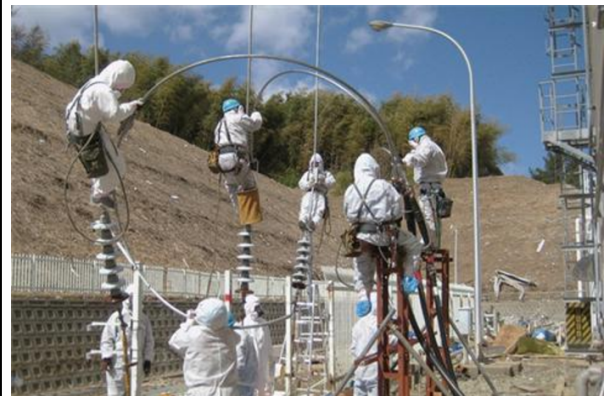
Contract workers doing repairs

Those who answer these offers may have little awareness of the dangers and they are likely to have few other job opportunities. $122 an hour is hardly a king's ransom given the risk of cancer from high radiation levels. But TEPCO and NISA keep diffusing their usual propaganda to minimize the radiation risks.