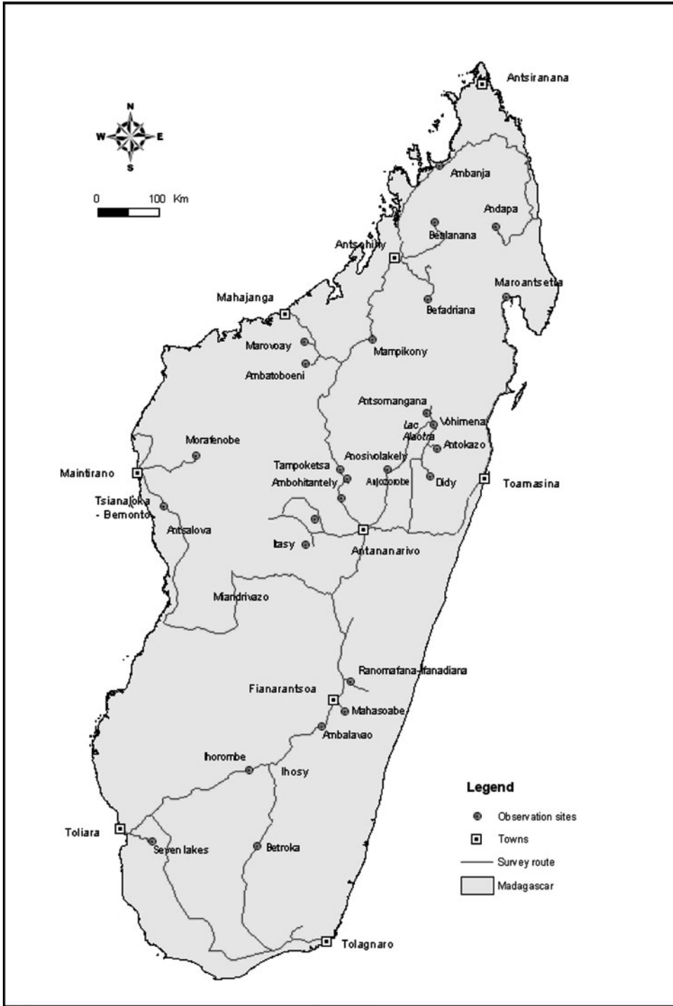
Figure 1. Observation sites and roads travelled during surveys for Madagascar Harrier Circus macroscelus from 2005 to 2006.