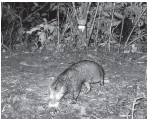
Plate 1 Camera trap picture of an otter civet in Way Kambas National Park, Sumatra, 1996.

considered diagnostic for the species (Pocock, 1933). It was identified by Thomas (1928) as an immature C. bennettii . It is difficult to confirm the status of C. lowei because the small number of museum specimens of C.