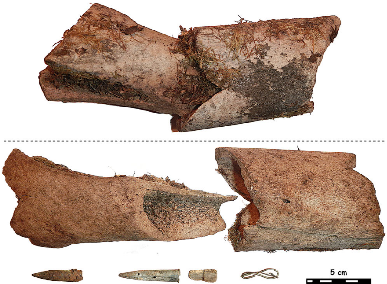
Figure 4. Top: Conjoined pieces of cattle bone found on top of a PoW rubbish dump. Bottom: The underside of the bones, and the items found concealed inside them: a bullet, a metal cylinder and a wooden cork that capped it, and a knotted electrical wire found inside the cylinder.

to intimidate the Germans. Notably, the star is upside-down for a Soviet star and also has the inner lines carved within the star, thus resembling the pentagram symbols used in traditional folk magic.