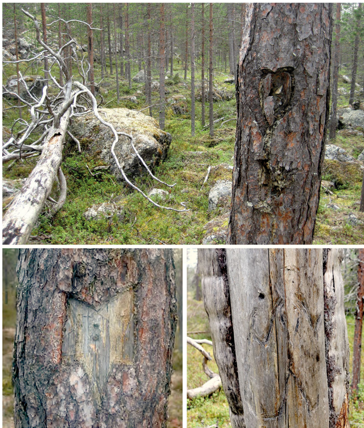
Figure 7. Top: Heart carved into a pine at the Kankiniemi PoW camp. Bottom left: 'Partisan star', a pentagram carved on a pine along a German-built wartime Kopsusjärvi track in Sodankylä, with a bullet hammered into its centre.