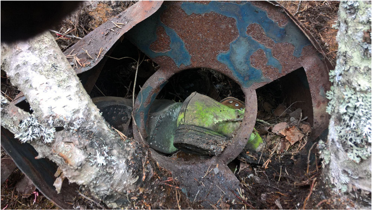
Figure 8. Women's shoes placed inside a wartime stove.

of PoWs and their harsh treatment, which disturbed local people, and perhaps explains why PoW camp sites have a particular 'haunting potential', with memories and places becoming entangled so as to make them experientially disturbing.