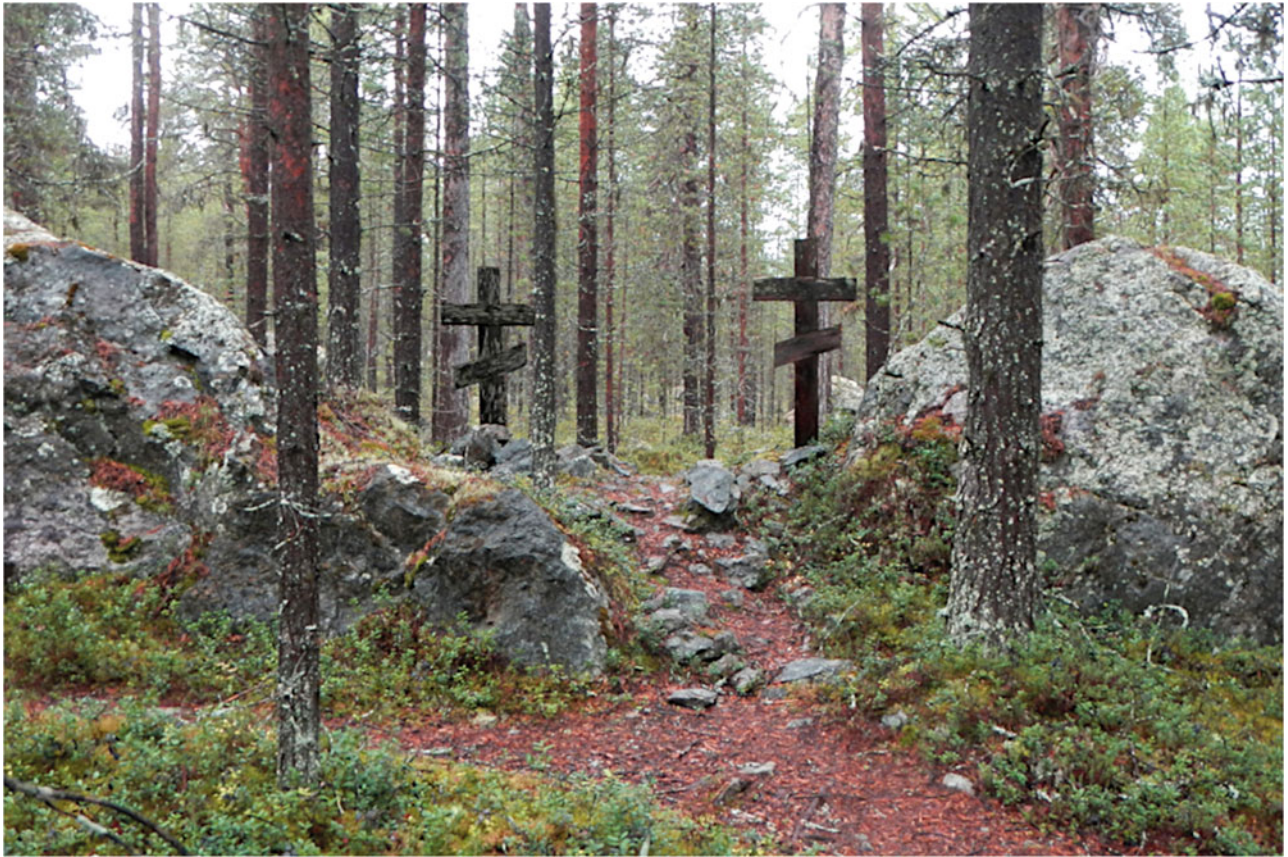
Figure 9. Orthodox crosses in a gate-like setting on both sides of a path leading to a PoW mass grave on the boundary of a PoW camp at Inari Martinkotajärvi.

sites and their impact on people need to be understood. These sites with their various materially and perceptually ‘strange’ features can stir up ‘existential’ reflections about people’s relationship with the surrounding world, as well as the relationships between the past, present and future, as exemplified by the haunting experience of our volunteers at Kankiniemi. The elusive ruins of German sites bring the wartime and its many troubling legacies close to people and force them to face the past in an unmediated manner. This is, conceivably, an important reason why they provide a suitable and powerful ‘infrastructure of haunting’ (Holloway 2010), and thus provoke ghostly experiences and narratives in a landscape that is historically, culturally and experientially ‘fit’ for such experiences.