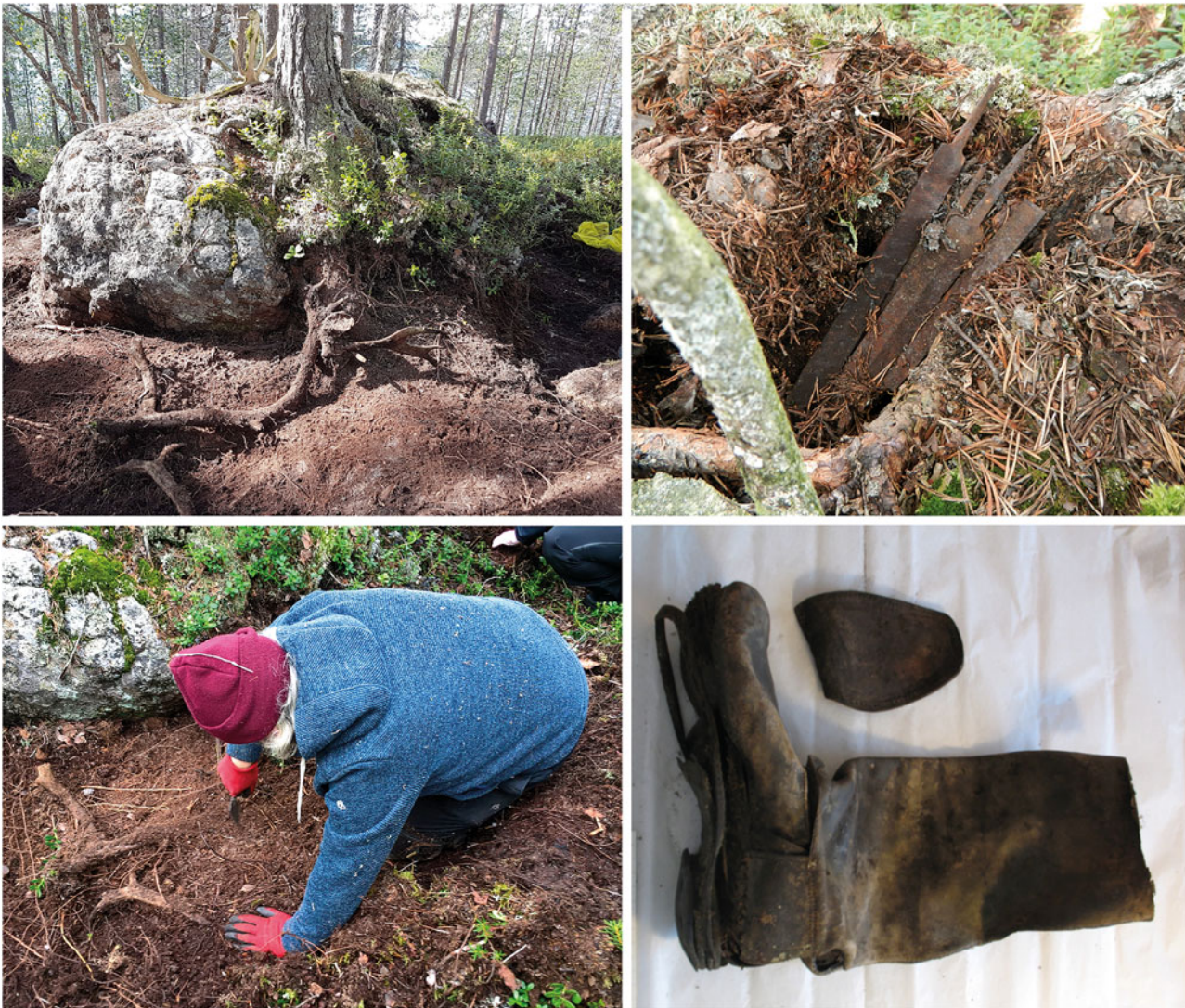
Figure 3. Selected features documented around the boulder at Hyljelahti. Top left: Reindeer antlers on top of the boulder and three more antlers entangled with the tree roots being excavated at the base of the boulder. Top right: Four files found in a bundle under the turf below the antlers on the top of the boulder. Bottom left: Iain Banks uncovering the three antlers and the German military jackboot that covered the antlers at the base of the boulder. Bottom right: The German jackboot excavated by the boulder, after conservation.

as paint cans, look like casual dumping of rubbish. Whether or not there is a direct link here, the non-casual depositing echoes traditional Sámi sacrificial practices at sieidi sites. There is a long history of ‘spiritual engagement’ with the environment and various landscape elements in northern Fennoscandia, sometimes involving depositional practices, from prehistory to modern times, and not only among the Sámi (e.g. Äikäs 2015; Herva & Lahelma 2019). Several features of the Hyljelahti boulder have connections with finds and features from some other sites in Lapland that relate to the folkloric traces of the German military presence in WWII. Overall, we