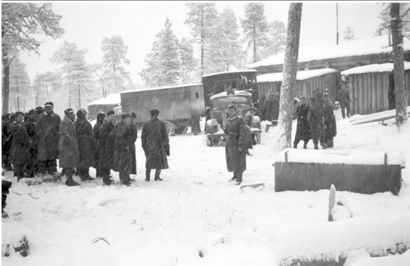
Figure 1. Top: Multinational Sápmi and the discussed sites in northern Finland. (1) Inari Hyljelahti; (2) Inari Haukkapesäoja; (3) Inari Kankiniemi; (4) Inari Martinkotajärvi; (5) Sodankylä Kopsusjärvi; (6) Savukoski Seitajärvi. (Background map: Esri.) Bottom: Soviet Prisoners of War (on the left) outside their log house with German guards (on the right) at Inari Haukkapesäoja, Lapland. (Photograph: Max Peronius 1941–1944/Antti Peronius.)

are still very much in the margins of both the research and the grand narratives of modern war. 1 Nonetheless, there are indications that superstitions, with their material/talismanic expressions, abounded also during WWII, as illustrated by MacKenzie's (2015; 2017; see also Gregory 2019) research on superstition as a means of coping with the constant threat of death. Recent work in Finland has indicated that premonitions and other strange ('supernatural') experiences were common among Finns both on