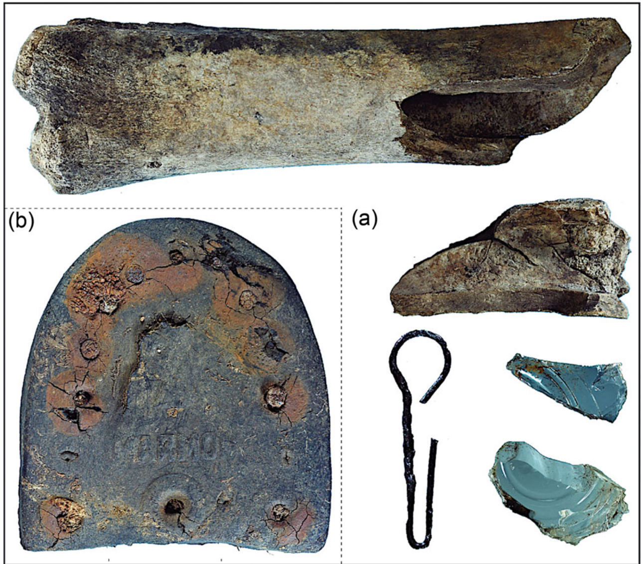
Figure 5. Finds uncovered at the base of the Taavetti Lukkarinen hanging-tree. (a) The bone and the finds concealed inside it; (b) The shoe sole that capped the bone deposit. (Illustration: Emilia Jääskeläinen. Ikäheimo & Äikäs 2018, 102.)

have been an important and valued sacrificial item throughout much of the history of the Sámi sieidi , attested by sources since the sixteenth century (Olaus Magnus [1555] 1998). While the boulder at Hyljelahti is not a sieidi , this comparison helps to put the site in a broader historical context of northern human–environment relations, instead of regarding it merely as an isolated curiosity.