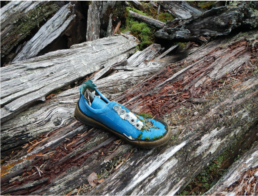
Figure 6. Post-war child's shoe found wedged under the corner logs of a PoW log house at Inari Haukkapesäoja.

which also takes us back to Haukkapesäoja that produced the child's shoe placed underneath the corner of a PoW house and the 'bone bundle' from the PoW dump at a border of the camp. If Ikäheimo et al. (2016) are correct in their interpretation of the Oulu memorial site, the bone bundle from Haukkapesäoja could be interpreted as an analogous 'spirit trap', intended to pacify a locally ill-reputed site. The shoes from Hyljelahti and Haukkapesäoja echo a different but related folk tradition, in which shoes have been assigned special cultural meanings due to their 'liminal' character. Shoes are artefacts between self and the world, and they are 'imprinted' materially with the footmark of the user and the personality of their wearer, which make them distinctively personal artefacts (Randles 2013; Swann 1996).