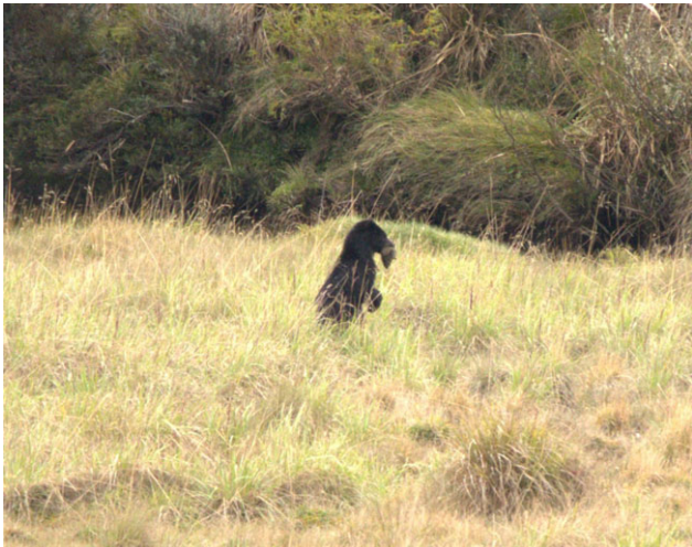
Figure 2. An Andean bear of unknown sex carries a captured wild guinea pig in its mouth.