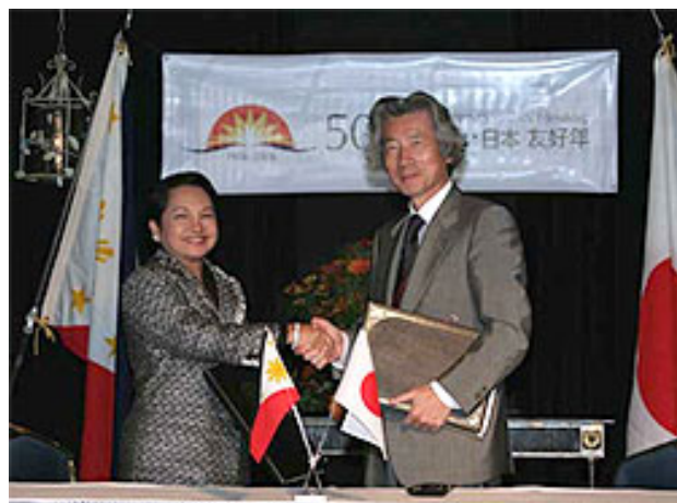
Philippines President Gloria Macapagal Arroyo shakes hands with the former Japanese Prime Minister Junichiro Koizumi after the signing of the Japan-Philippines Economic Partnership Agreement on September 9, 2006.

In Japan, the JPEPA was pushed forward by MOFA and METI. MOFA sees the JPEPA as an avenue to enable people with certain professional qualifications and certain citizenships to work in Japan for some limited time. Via the JPEPA, MOFA encourages labor migration to Japan, including medium- and lower-skilled workers, without going through the lengthy process of instituting legal reforms.