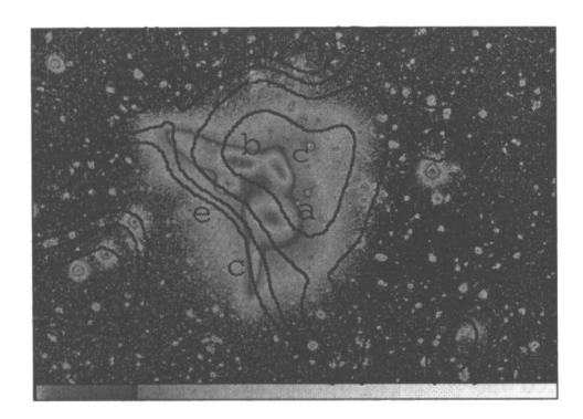
Figure 1. VR + I image of SS (gray scale) and X-ray intensity map (contours).