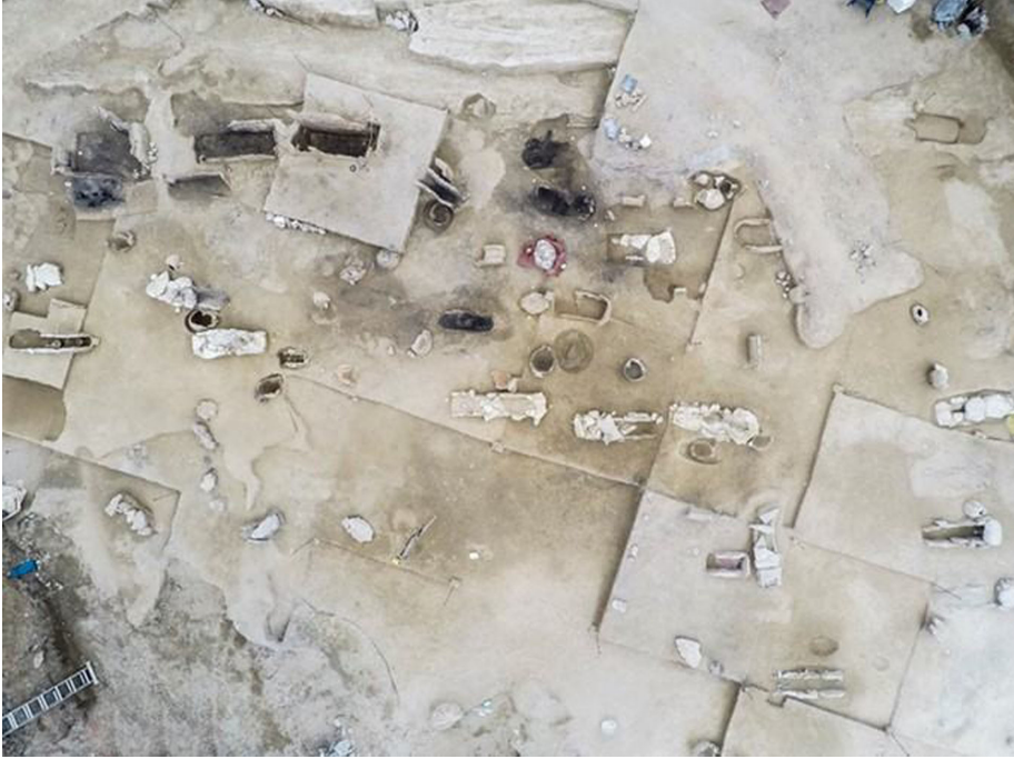
Fig. 8.4. Phaleron. Eastern part of the cemetery (Esplanade Sector) revealed in 2016.

Karligkioti and colleagues (2023) found high levels of hardship in rural populations in Attica ( Paiania, Koropi, Varambas, Agia Marina, Xereas ) from the Classical to the Roman period. Temporally, individuals from the earlier periods showed higher mechanical stress but lower physiological stress compared to those of later periods. With regard to sex differences, no significant differences were found between males and females in physiological stress. However, labour division changed between the Classical and Roman periods since the former was characterized by no sex difference in manual labour, while the latter witnessed greater mechanical stress among males compared to females. Although any interpretations emanating from this study are limited by the small sample sizes, it underscores the necessity of bringing together multiple lines of osteo-archaeological evidence.