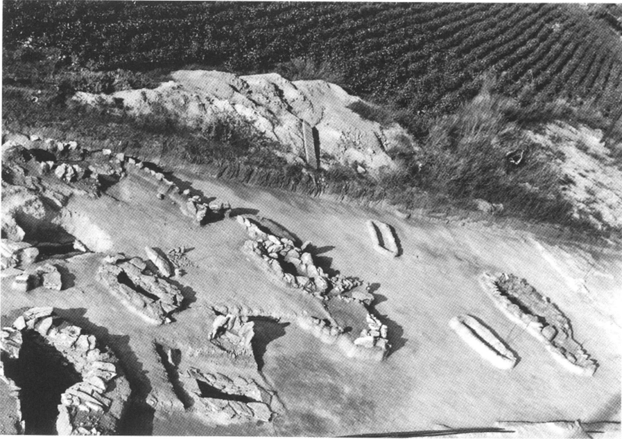
Fig. 8.3. Platanos Almyrou, Halos. Iron Age necropolis.

A study by Courtney McConnan-Borstad and colleagues (2018) is noteworthy for its examination of the impact of natural events on dietary patterns. The study investigated dietary trends from the Hellenistic to Byzantine period in Helike to determine if meat restrictions that applied during fasting days in the Byzantine period could be detected isotopically. Although the meat restrictions would be expected to result in higher fish consumption in Byzantine times, the stable carbon and nitrogen isotope results revealed that the diet of Byzantine period individuals actually contained fewer marine resources compared to those in the Hellenistic period. Similarly, Roman diet was based on terrestrial resources with limited marine inputs. The authors suggest that these temporal trends may not reflect cultural practices, but they may instead be linked to a lagoon that formed after the 373 BC earthquake, facilitating access to aquatic resources temporarily.