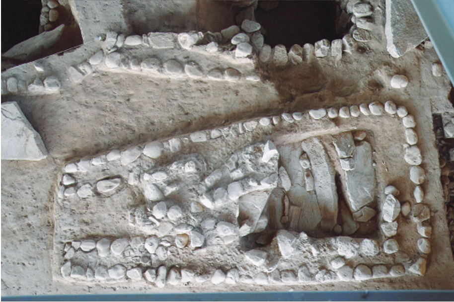
Fig. 8.1. Marathon, Tsepi. Tomb 43, © ASA.

Biodistance analysis has also been used to study mobility at a much smaller scale. An example of such an application involved the examination of kinship and postmarital residence patterns at the Tsepi cemetery (ID6140; Fig. 8.1) in prehistoric Marathon (Prevedorou and Stojanowski 2017). The intra-cemetery biodistances showed that various forms of kinship (biological, fictive, practical) were reflected in the burial practices. Biological lineages influenced the spatial arrangement of tombs to some extent, while male exogamy was postulated on the grounds of greater phenotypic (morphological) variation in males compared to females.