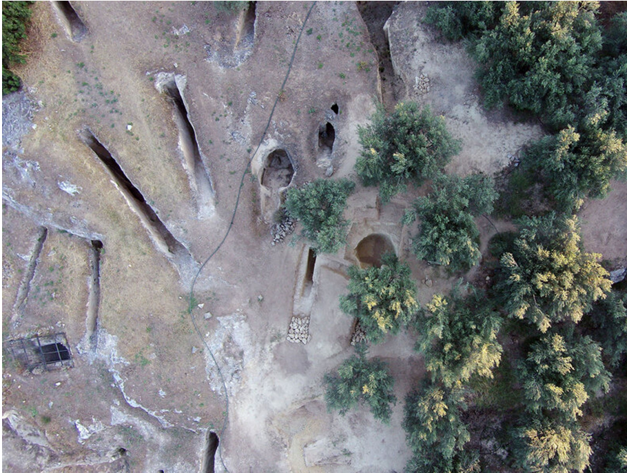
Fig. 8.2. Aidonia. Aerial photograph showing the dromos and chamber of the two new unplundered tombs in the E part of the Mycenaean cemetery, as well as tombs from the previous excavation.

Peloponnese, Makri in Thrace, and Tharrounia (ID14974) on Euboea. The results revealed genetic homogeneity in Greece until the Neolithic era, but a discontinuity between the Neolithic population and modern Greeks. Additionally, after the rapid spread of the Neolithic culture, mobility along the Danube expansion route decreased and genetic inputs from local hunter-gatherers on farming communities increased.