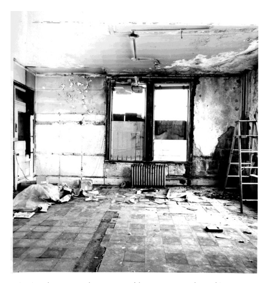
Figure 3 Pier Six at the Boston Harbor.

also query text's 'veiled receiver'. Film is Ronell's preferred exemplar. Disembodied voices might sometimes direct the diegesis by roving, uncanny and horrifying, over telephone lines, but the telephonic aperture also 'makes felt a connection with reception history' that cannot be fully claimed in and as the acousmêtre 's thingified authority. 31