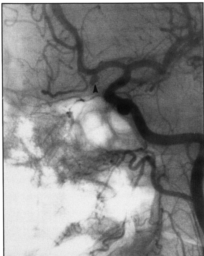
Figure 1 — Anteroposterior oblique view, left common carotid angiogram. A small aneurysm at the left anterior cerebral-anterior communicating complex (arrowhead) was shown.