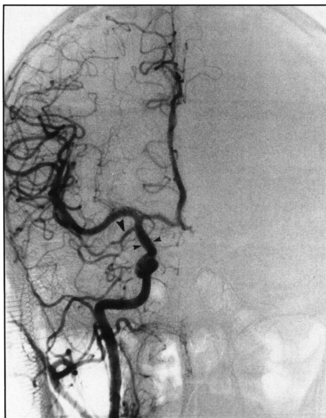
Figure 2 — Anteroposterior view, right common carotid angiogram. The supraclinoid internal carotid fenestration was superimposed upon itself as a double density (opposing small arrowheads). The accessory middle cerebral artery (large arrowhead) was also well shown.