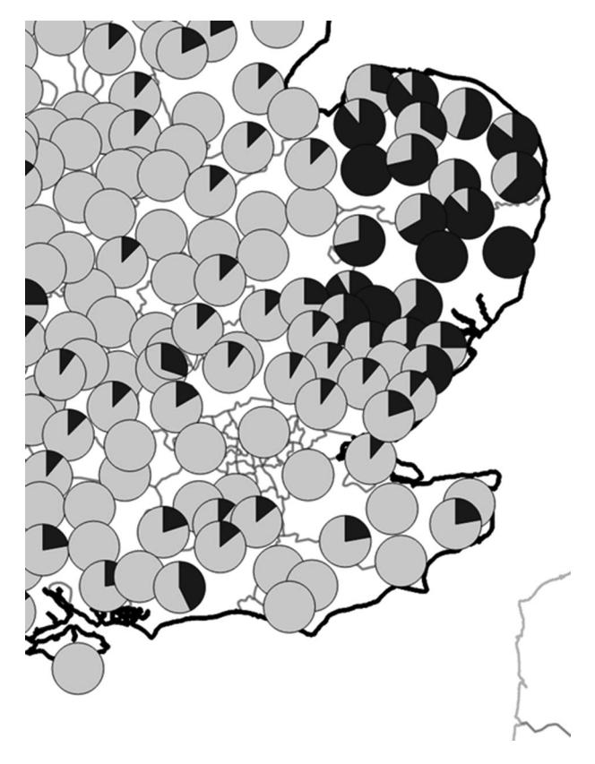
Figure 2. The use of third-person present-tense zero in the Survey of English Dialects (Orton et al., 1962–1971; see also Britain et al., 2021:333).

are also found in other traditional dialect surveys of East Anglia (see Vasko, [2009] for Cambridgeshire, and Peitsara [1996:295] for Suffolk).