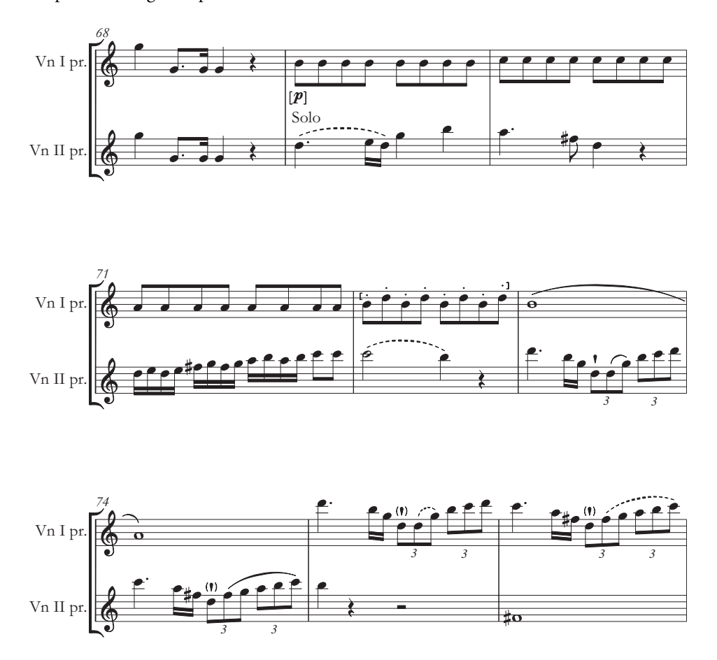
image by crafting instead a composition that is imbued with private feelings and memories of his Parisian sojourn. With the loss within his immediate family uppermost in his mind, Mozart writes a symphonic concertante replete with Parisian virtuosic flair, but one that is also calculated to fulfil individual needs and expectations in his hometown of Salzburg. Experiences and feelings that were difficult to put into words were poured into this special Parisian-inspired piece.

Example 5b Bologne, Op. 9 no. 1, bb. 68-76.