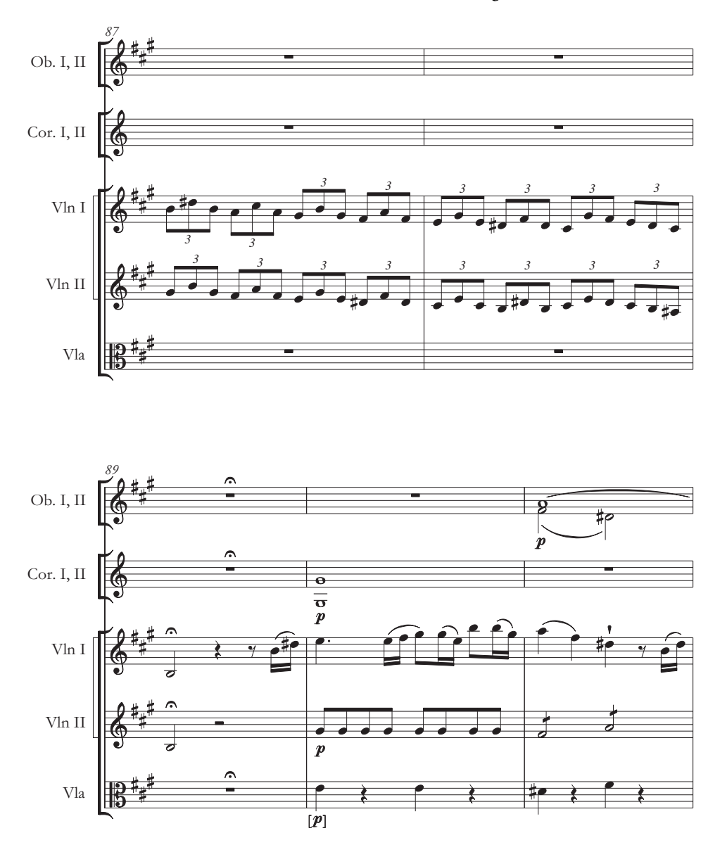
the soloists might engage in virtuosic display. Did dual 'concertante' wind players require more assistance than string players when crafting cadenzas? Or did Stamitz, who worked in Mannheim, Paris, and London during this time, want to ensure that soloists in different geographical locations would understand performance practices (and listener expectations) in other centres? Or was he showing wind instrumentalists

Example 8 Joseph Bologne, Symphonie concertante in A major for two solo violins and viola, op. 10 no. 2, ed. by Melanie Braun, The Symphony 1720–1840 , editor-in-chief, Barry S. Brook, Series D, vol. IV, score 8 (Garland, 1983), first movement, Allegro, bb. 87–91.