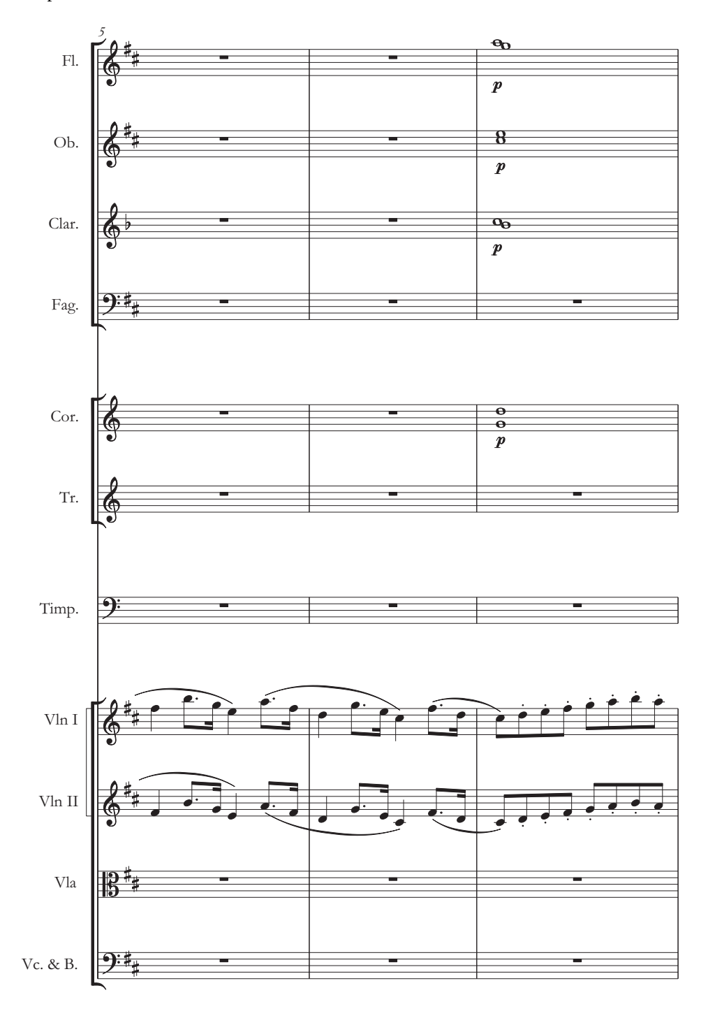
Example 4. (Continued)