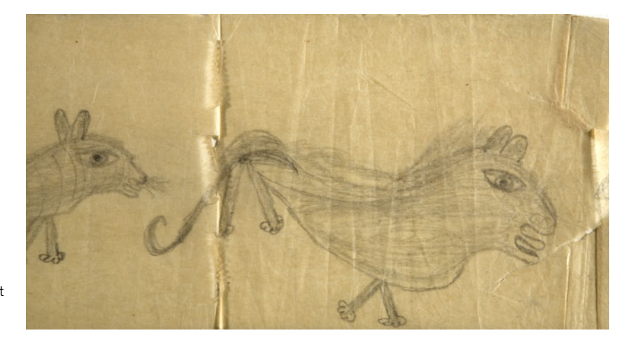
Fig. 2 Graffiti on Lavatory Paper 2: 3 Lions (detail) by J. J. Beegan, c. 1946. Match char on Izal medicated toilet paper.

In what ways does David O'Flynn think art therapies help? Is it an expression of distress and frustration without violence, respect for the production process or do the boundaries of the therapeutic group make it a safe place? Is it a validation of experience? Is it that the act of concentrating on producing an external concrete object, e.g. a painting, relieves the mind of tormenting internal preoccupations, allows distancing and an objectification of thoughts and feelings and thus provides a positive relief? Could engagement with the medium in a quiet place, with a soothing but nonjudgemental parental presence, perhaps allow some reworking or reawakening of childhood playfulness?