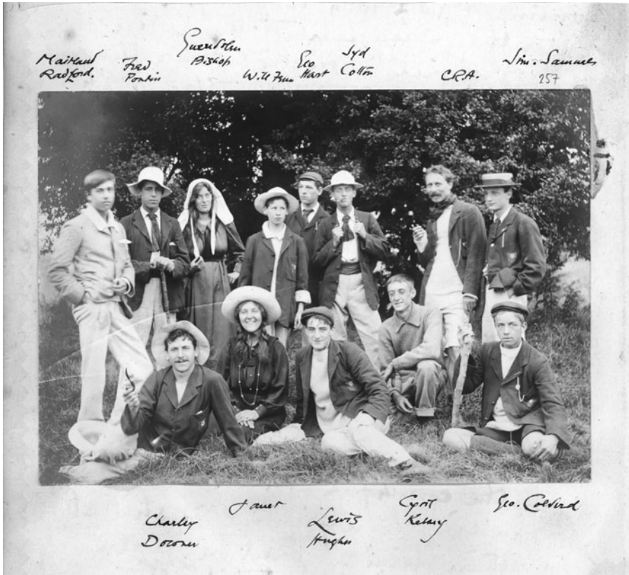
Figure 1. Guild of Handcraft River Expedition 1901: Bishop is standing third from left.