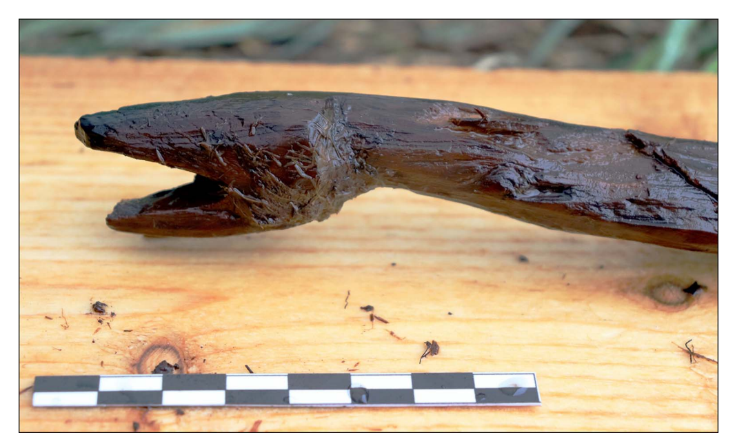
Figure 4. Detail of the head profile.