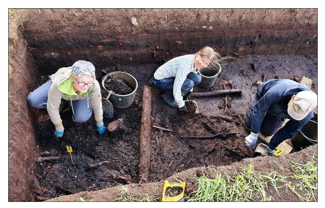
Figure 2. Fieldwork in progress in 2020.

of slithering or swimming away. The direct radiocarbon date of the artefact yielded a Late Neolithic date of 3908±32 BP (Ua-67655: 2471–2291 BC at 95.4% (Bronk Ramsey 2009; Reimer et al. 2020)).