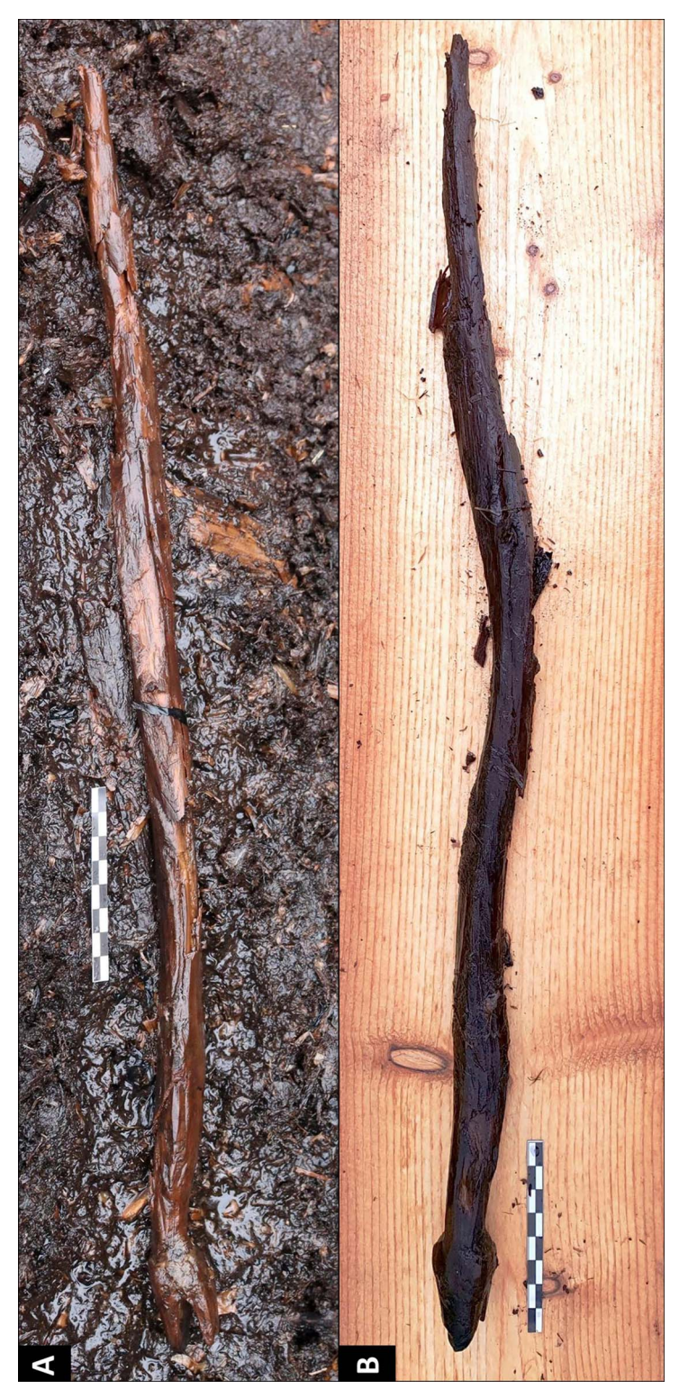
Figure 3. a) The snake figurine in situ; b) the excavated artefact photographed from above.