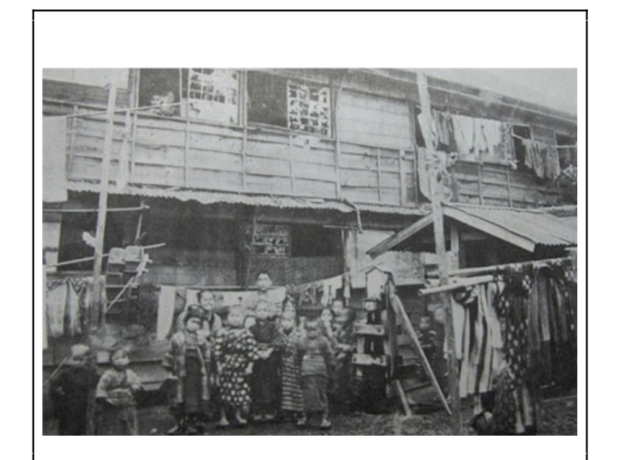
Tokyo tenement 1920

RAG-DEALER: Well, sir, there are all kinds of rag-dealers, and I happen to specialize in old clothing so I'll give you a much better price than other dealers would.