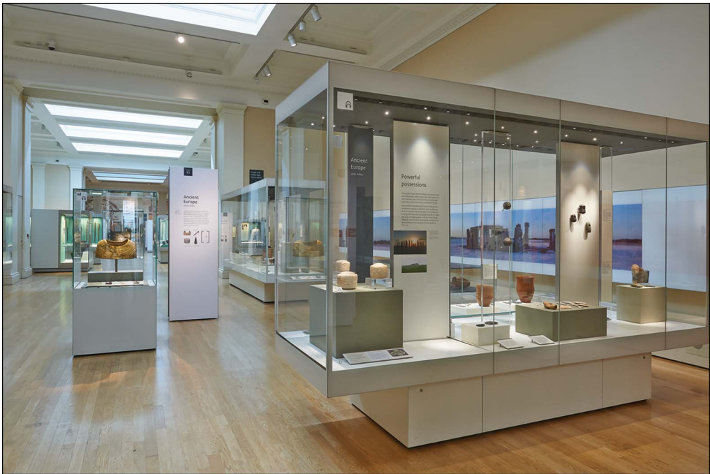
Figure 2. Neolithic and Bronze Age objects on display in Gallery 51 at the British Museum today (photograph © The Trustees of the British Museum. Shared under a Creative Commons Attribution-NonCommercial-ShareAlike 4.0 International (CC BY-NC-SA 4.0) licence).

The resulting icon-oriented approach to display has had significant curatorial consequences. Firstly, while single objects can have many layers of meaning (Cooper et al. 2021: 135–43), they are more limited in what they can convey about complex processes (e.g. an axe displayed simply as a token of lifestyle or identity, rather than as one object of