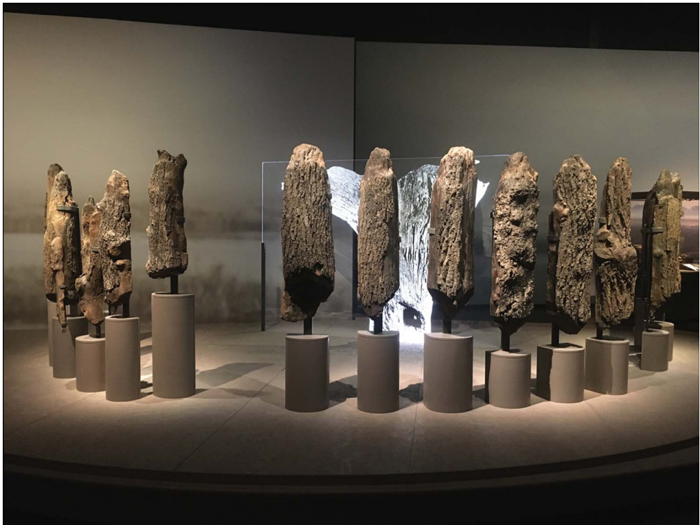
Figure 6. The Seahenge display in the WoS exhibition.

From these reactions we surmise that successful alternative icons are about more than changing approaches to the selection and written interpretation of objects. To offer alternative