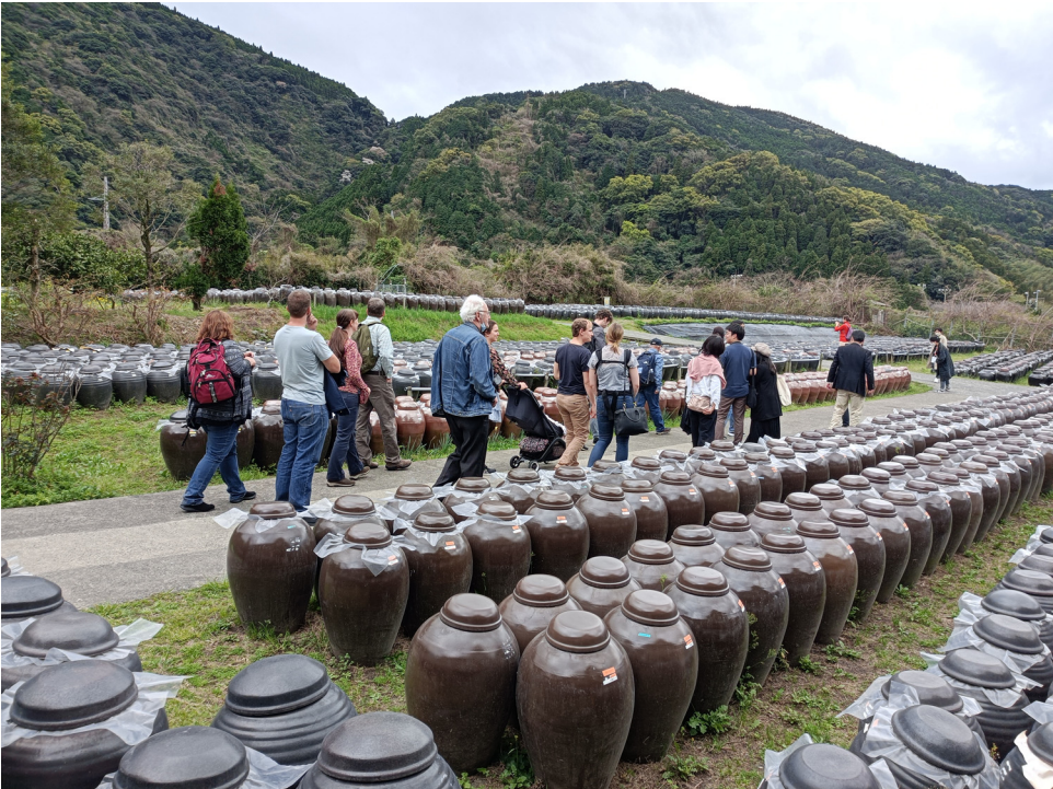
Photographs taken during the social events. Top: Afternoon tea during the excursion. Bottom: A local vinegar factory visited during the excursion.