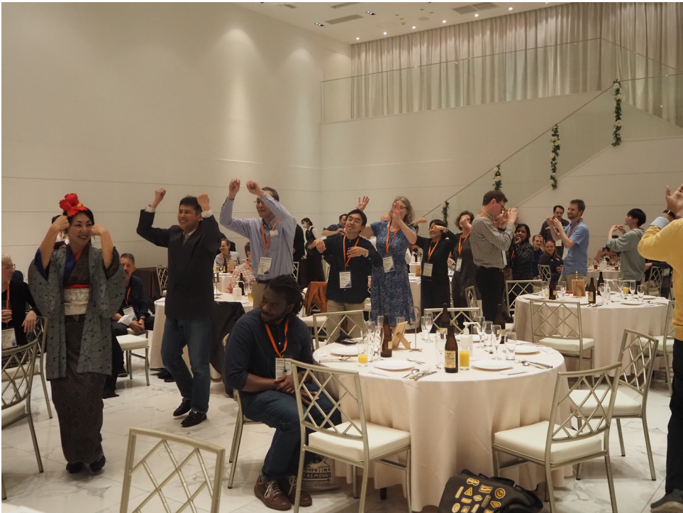
Photographs taken during the social events. Top: Observatory of the Sakura-jima volcano. Bottom: Dancing during the banquet.