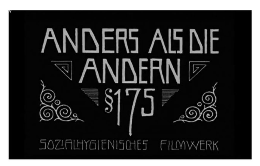
Filmmuseum München initial title card

the film within its revolutionary context. It presents the audience with a "brochure" to read, historicizing the experience.