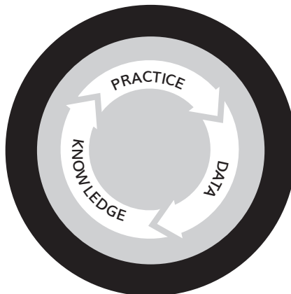
Figure 1 The data-knowledge-practice learning cycle

Using data collected during routine care for learning system purposes is not straightforward. Because the data is generated as a by-product of care provision, it is not always high quality. If collected data is inaccurate, incomplete, or out of date, then the knowledge generated may have the same problems, which could result in poor decisions and possibly harm to patients. 21 Improving data quality requires a multi-level, sociotechnical effort from patients and staff, clinical coders, system designers, and analysts, ideally supported by some higher-level oversight. For example, in the NHS, the automated Data Quality Maturity Index (DQMI) 22 is used to assess the quality of data submitted by providers. DQMI results are published and fed back to data providers to drive improvements. However, the DQMI cannot detect some important aspects of data quality, such as inaccurate data flowing from a provider. Catching such errors currently depends on analyst's contextual knowledge of the dataset, the