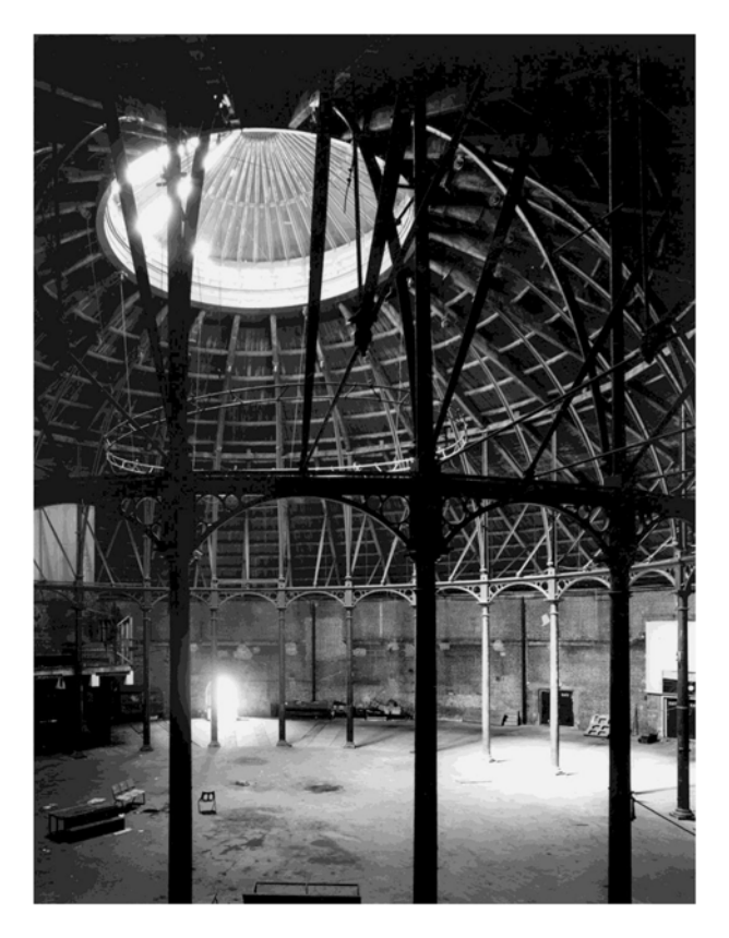
Figure 1. Interior of the Roundhouse, undated.

of new, freer selves. Unrestricted communication within the dense network of participants would produce dissident knowledge. The planned environment would both prefigure a liberated society and give birth to the ideas necessary to its construction.