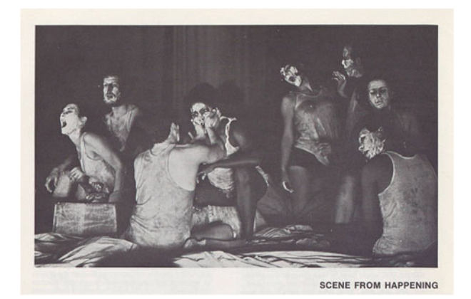
Figure 5. Members of the "core group" during their performance of Carolee Schneemann's "Round House."

On the night of the performance, approximately five hundred people gathered in the Roundhouse, arranging themselves in "a huge semi-circle."<sup>114</sup> At the center were the artist and performers, a horse, and a cart, surrounded by debris.<sup>115</sup> The atmosphere inside the venue was tense: Schneemann later remembered the audience as "testy," "aggressive," and full of hecklers.<sup>116</sup> But these dynamics changed as "the core group's developing closeness spread into the actions of the mass group," and then out into the audience (Figure 5).<sup>117</sup> The activation of the audience, which Schneemann intended to draw into a spontaneous creative process, was achieved through multiple kinetic and sensory effects. As the poet Susan Sherman described in her detailed account of the work, the actors abandoned the stage, dispersing themselves across "the total area of the theatre."<sup>118</sup> Disturbing images and sounds wore down the audience's defenses, provoking their "honest emotional reaction[s]." At one moment, "shapes of greased, foil-covered, sweating human bodies [were] silhouetted against pictures of newsreels and scenes from Vietnam," a layered assault that many "could not bear, even for an hour, to sit still and listen [to]."<sup>119</sup> The concluding movement brought catharsis: people rose from their chairs to dance as the Social Deviants, a psychedelic rock band, showered them with electrically amplified sound, bottlecaps, and blinding light.