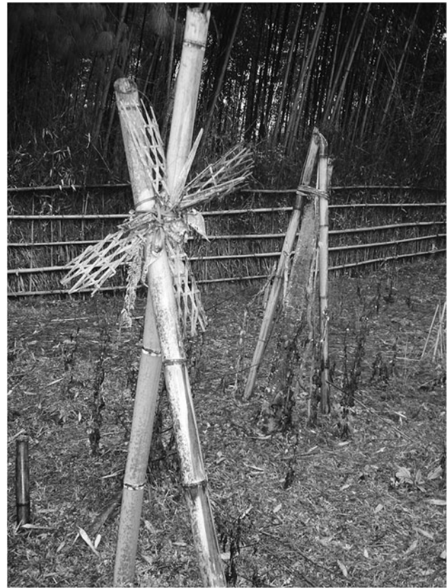
PLATE 1 A traditional Dapo symbol for biodiversity conservation is put at the entrance of a forest foot path, indicating that the forest is protected by customary law.

The observation of the decline of the orange-bellied Himalayan squirrel by the Apatani and the subsequent conservation initiatives instigated by the community is an opportunity for government agencies and other groups concerned with biodiversity conservation. We observed that creating awareness of the squirrel's decline is not necessary; rather, the opportunity provided by the community's own concerns could be used to promote conser-