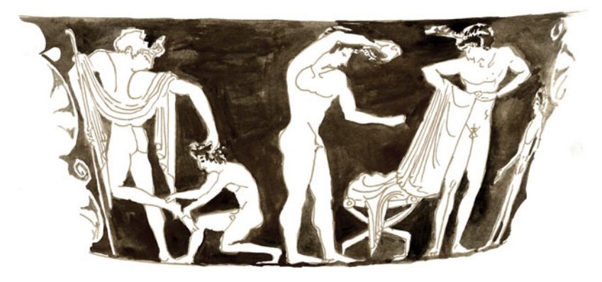
Figure 3. Attic red-figure calyx-krater, attributed to Euphronios, Capua, BAPD 200063(drawing by Adam Chmielewski)