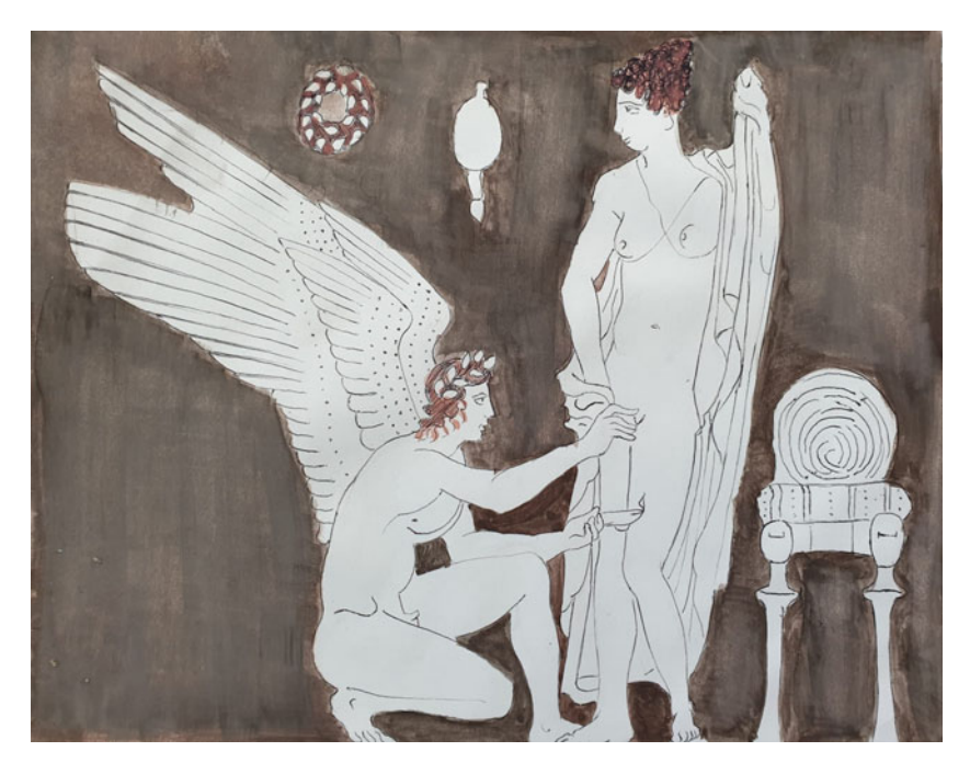
Figure 7. Attic red-figure bell-krater, attributed to the Dinos Painter, Cambridge, MA, BAPD 44027 (drawing by Nicoletta Candurra)

gynaikeion is often depicted as thronged by women, some sitting and some not. Next to them there are stools and chairs with objects on them, usually textiles. Some other stools may be completely empty, and it is often unclear whether they are meant to be sat upon, used for some other purpose or simply contribute to the characterisation of the space as a domestic one (e.g. Fig. 9).