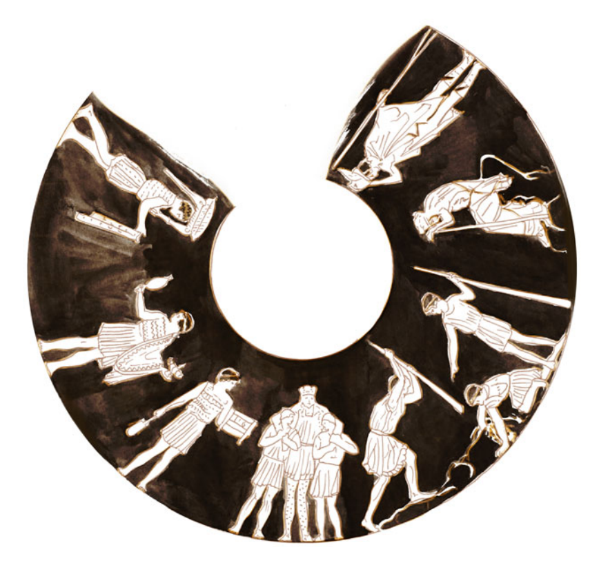
Figure 11. Attic red-figure hydria, London, BAPD 213802 (drawing by Adam Chmielewski)