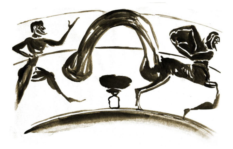
Figure 2. Attic Siana cup, attributed to the Painter of Boston, Bochum, BAPD 3881 (drawing by Adam Chmielewski)