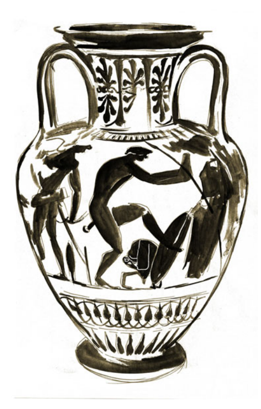
Figure 4. Attic black-figure neckamphora, BAPD 9031264 (drawing by Adam Chmielewski)