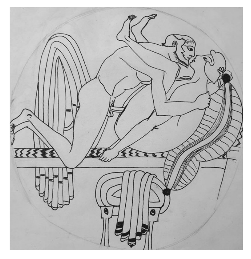
Figure 8. Attic red-figure cup, attributed to the Triptolemos Painter, Tarquinia, BAPD 203886 (drawing by Nicoletta Candurra)

attendant, or just about to be put down (e.g. Fig. 10). A striking example of a variation on this theme is provided by a red-figure hydria which depicts Andromeda's mock wedding procession, in which slaves carry a stool along with a mirror, jewellery box, unguent flask and the like (BAPD 213802; Fig. 11).<sup>11</sup> The inclusion of the stool in the category of objects related to female toilette may seem quite unexpected to us, but the image under discussion suggests that the painter and – presumably – his audience took its meaning for granted.