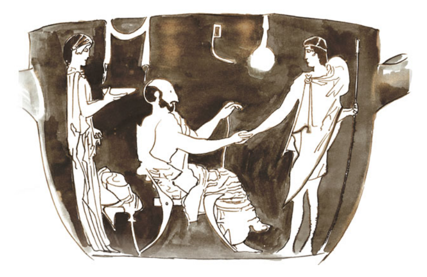
Figure 5. Attic red-figure bell-krater, in a manner of the Villa Giulia Painter, Vienna, BAPD 2195 (drawing by Adam Chmielewski)