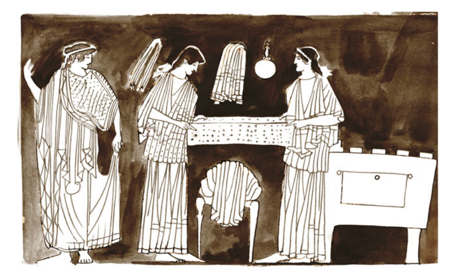
Figure 9. Attic red-figure stamnos, attributed to the Copenhagen Painter, BAPD 202936 (drawing by Adam Chmielewski)