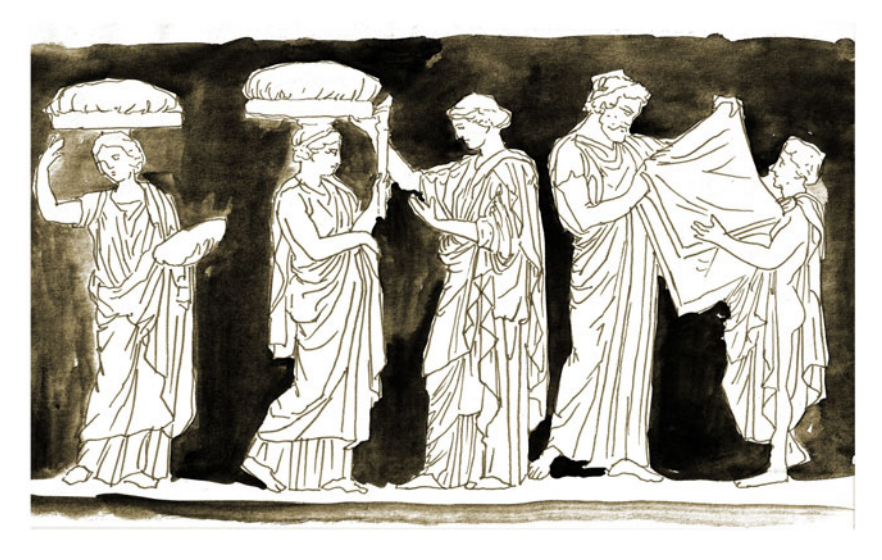
Figure 1. Central part of the east Parthenon frieze (drawing by Adam Chmielewski)

Beazley Archive Pottery Database, henceforth (BAPD), I was able to identify about 270 chairs and almost 600 stools on which no one is sitting. In some relatively rare cases, it is clear from the context of the representation that an empty seat is meant to be taken by someone.<sup>4</sup> Otherwise, they seem to fall into several overlapping categories:<sup>5</sup>