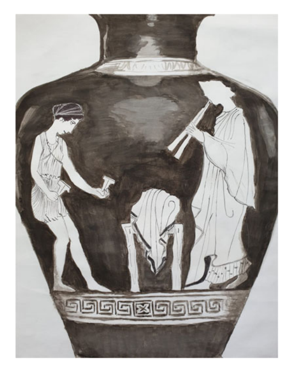
Figure 6. Attic red-figure oinochoe, attributed to the Phiale Painter, Paris, BAPD 214278 (drawing by Nicoletta Candurra)

removed only the cloak. Sometimes an empty seat is clearly meant to suggest that the performance is on the point of commencing, as the performer is clearly meant to deposit his or her garments on it (Fig. 6).