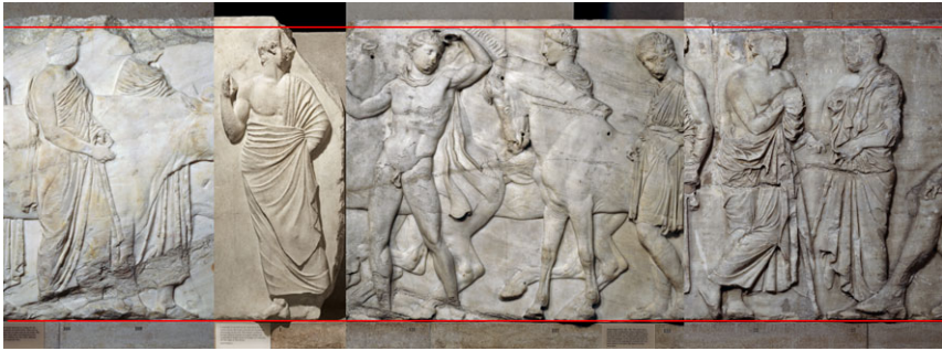
FIG. 1: Representative heights of male figures on the Parthenon Frieze, from L to R; South XLI figures 123, 124, West I figure 1, North XLVII figures 133, 134, East IV figures 20, 21. Pentelic marble low-relief carving, 442–438 B.C.E. British Museum, 1816,0610.87, 1816,0610.46.a, 1816,0610.46.b, 1816,0610.18.

figures on the frieze (see Fig. 1), indicates that they are mortal. 23 I shall return to these men below (in spite of my assertion that we should perhaps not worry about a firm identification).