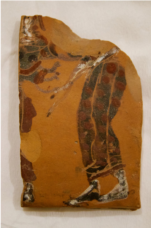
FIG. 6: Black-figure painted terracotta pinax , c.560 B.C.E. Hellenic National Archaeological Museum, Athens, Akr. 2540.

sacrificial animal or with some other form of deed—whether a sacrifice, offering or performance. 56 This captures the offering of the animal to the divinity before the sacrifice. There are very few visual representations of the act of sacrifice itself, and these almost exclusively occur on vases. 57