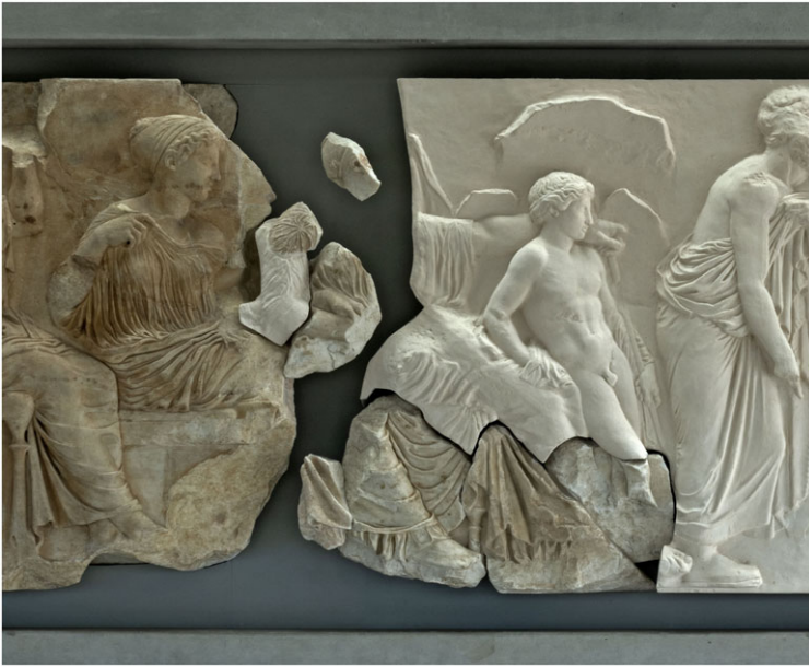
FIG. 3.1: Parthenon Frieze, East VI, figures 40–2. Pentelic marble low-relief carving, 442–438 B.C.E. Akropolis Museum, Athens, Akr. 856.