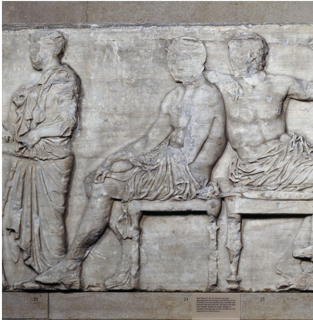
FIG. 4: Parthenon Frieze, East IV, figures 32–5. Pentelic marble low-relief carving, 442–438 B.C.E. British Museum, 1816,0610.18.