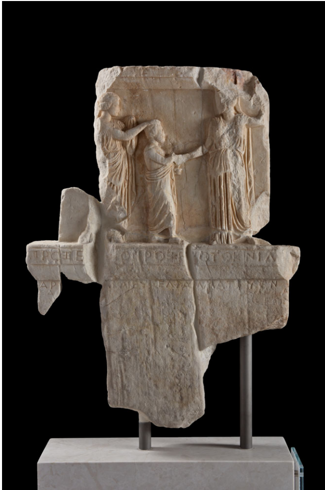
FIG. 9: Pentelic marble relief stele, c.420 B.C.E. Akropolis Museum, Athens, Akr. 2996.

wedding-related iconography together, an aspect which marries her roles as both goddess of civic togetherness and sexual union, via the production of legitimate children to facilitate the continued propagation of the demos . 62