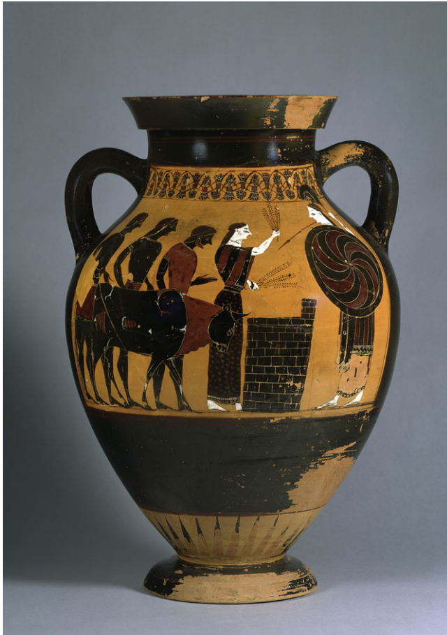
FIG. 2: Black-figure amphora, c.550–530 B.C.E., Staatlichen Museen zu Berlin, Antikensammlung F1686.

snaky-fringed aegis resting in her lap, mirroring Zeus's posture. She faces Hephaistos, who had strong connections to the myth of Athenian autochthony. He has a crutch supporting his arm, a subtle nod to his disability. Following this is Poseidon, who looks away from the pair and towards the procession, brushing Apollo's shoulder. The younger god looks back towards the elder, in conversation. Next is Artemis, who is also facing the procession and adjusting her chiton, which has slipped off her shoulder. Seated next to her, at the end of the line of gods, are Aphrodite and Eros. The way these gods are presented are clearly a representation of the relationship the Athenians feel they have—or aspire to have—with these gods. We can tell this by the way in which Athena is presented: relaxed, her aegis in her lap, waiting for the brand new dress she is about to receive from her favourite people.