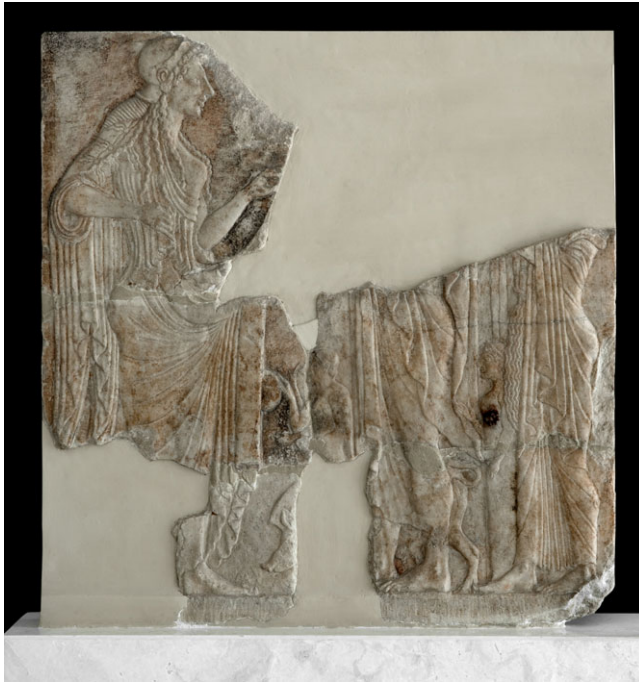
FIG. 5: Parian marble low-relief carved votive plaque, c.490–480 B.C.E. Akropolis Museum, Athens, Akr. 581.

and Athena, the beginning of their lifelong reciprocal relationship. Athena grasps the central pleat of her long Ionic chiton, pulling it away from her body, in a gesture familiar from korai statues from the same period. 55