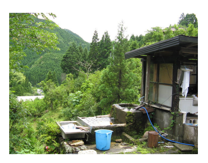
Overgrown fields and abandoned houses, like this one in a village in Mie Prefecture where just two residents remain, are a common sight in rural areas.

"Bear management consisted of killing bears," says Maita. That is still the case in many areas where the animals are not officially endangered. Sport hunting of Asiatic black bears, which is legal only in Japan and Russia, is declining and now accounts for about 500 bear deaths each year<sup>21</sup> (killing bears for their gall bladder is also still permitted in Japan). Nuisance kills are a far greater threat and account for 1,000 to 2,000 deaths per year on average.<sup>22</sup> Many villagers see bears as pests, says Maita, or simply don't know what to do when a bear appears in their back yard. Although Japan's black bears kill humans only in extremely rare cases, many people have little knowledge of their behaviour. Standard practice until recently had been to call the local government, which would call a hunter and have the animal killed. Even in protected areas "problem bears" can still be dealt with in this way. And for local officials who, thanks to a 1999 change in wildlife management law, now have final say on how bears are handled, the perception that in some areas numbers are increasing only bolsters their image as a pest to be controlled.