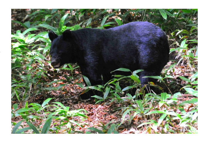
A Japanese black bear in the mountains of

Maita had come face to face with the strange reality of contemporary Japan: although it is among the most heavily forested countries in the world, much of it has become uninhabitable for bears and other wildlife. Sixty years of development and urbanization have reshuffled ancient patterns of land use and radically changed the composition of Japan's forests. Habitat for ordinarily shy mountain wildlife has shifted closer to villages, causing conflict with humans to increase.