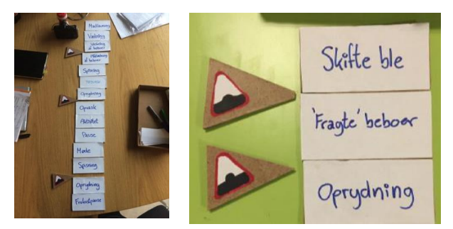
Figure 4: The sequence analysis design game. The game pieces to the left illustrating road bumps and the writing to the right saying: Change diaper, moving resident and cleaning.

During the dialogue it became apparent that the staff often felt conflicts arise in one-to-one situations making it difficult for them to carry out meaningful care. The staff raised the idea of a future sensory technology being mobile, enabling the residents to use such technologies inside their own apartments where conflicts mainly arise. The team immediately followed up on this idea by opening up for dialogue about functions and use of a potential future solution.