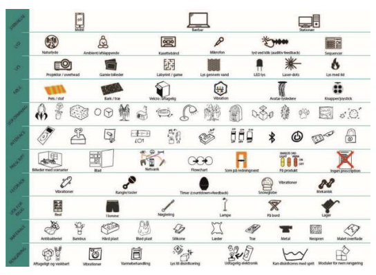
Figure 6: Morphology scheme with sub-solutions from staff and the design team

During the co-design session a lot of interesting ideas were generated. However, during the morphology session the team realised that most of the solutions suggested by the staff was based on already existing solutions. This made the team reflect that perhaps they had staged and framed the negotiations and the solution too narrowly. To make up of these dubious design choices, the team chose to stage a new brainstorming session. However, as the nursing staff could not allocate time for this within a few days of reaction, the team decided to do a brainstorming session among themselves and add these ideas to the ideas generated by the staff in an overall morphology chart (see Figure 6).