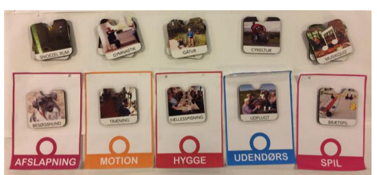
Figure 3: Illustration of the third and yet again modified design game (Note: 'Afslapning' = Relaxation, 'Motion' = Fitness, 'Hygge' = Cosiness, 'Udendørs' = Outdoor and 'Spil' = Gaming)

Again, it was difficult to keep the residents focused in the dialogue, and the pictures and smileys again appeared to be too abstract for the residents to relate to. Furthermore, the dialogues once again took place in the 'activity centre' where most residents walk in and out, watch television, or do various activities. The team designed yet another design game providing structure and an element of choice (see Figure 3). Furthermore, the dialogue was staged in another setting, e.g. the resident's own apartments, providing comfort and tranquillity.