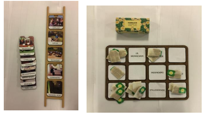
Figure 1: Illustration of the first design game

The dialogue was staged in the activity centre of the nursing home, and after having tried to engage 4 residents in a dialogue, the design team realised the materiality assumed a higher abstraction level, than the residents was able to engage in. The residents simply did not know what to do and just stared at the design team, while others wandered away. Thus, the design game did not succeed in acting as an intermediary object between the residents and the team. However, an important learning from these interactions was, that the team needed to come up with another approach to engage this particular group of actors. Since it was important for the team to engage with the residents to understand their concerns and motivations, they decided to stage a new dialogue based on a different design game. With basis in the same pieces as in the first dialogue, the team engaged the residents in a dialogue about the pictures and asked them to assign a smiling or angry smiley to each activity in accordance to whether they liked it or not (see Figure 2).