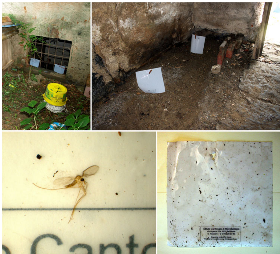
Fig. 2. Sticky traps used in Switzerland (Photo credit: Francis Schaffner).

collected from inside the trap by aspiration at the end of the trapping period. The animal-baited box trap (Espinola et al. , 1983) comprises a wooden box divided into two chambers which are connected by hinges and separated by a mesh screen. The large bottom chamber holds the bait animal while the upper chamber collects sand flies which are attracted to the animal and enter through two funnels in the box's lid.