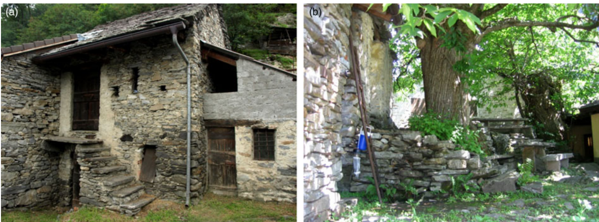
Fig. 6. P. perniciosus habitat (a) in Ticino, Switzerland, (b) CO 2 -baited light trap.