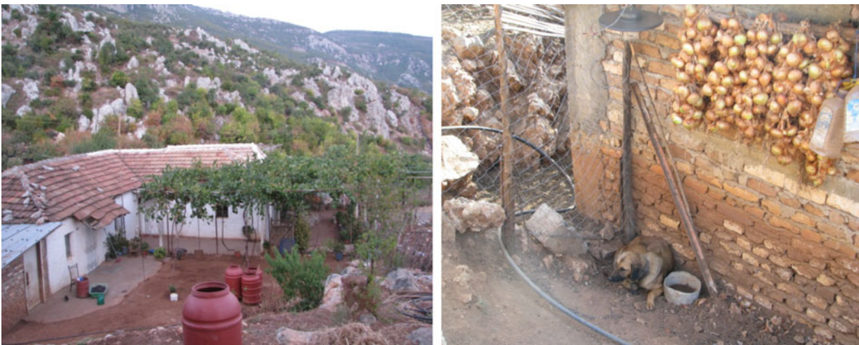
Fig. 5. P. tobbi habitat in Albania.