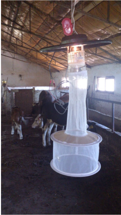
Fig. 1. Light trapping for sand flies in Turkey (Photo credit: Filiz Gunay & Gizem Oguz).

the entrance of the cylinders, e.g., reducing the opening size or fitting a wire mesh, to prevent the entry of larger flying insects, which may damage or eat fragile sand flies. Malaise traps can be assembled from everyday materials (Gressitt & Gressitt, 1962; Townes, 1962). Sand flies are likely to be trapped in small numbers, but an advantage is that both male and females will be caught, required for the identification of some species (Alexander, 2000). In addition, this method allows the detection of all sand fly species present within a habitat, while reducing sampling bias.