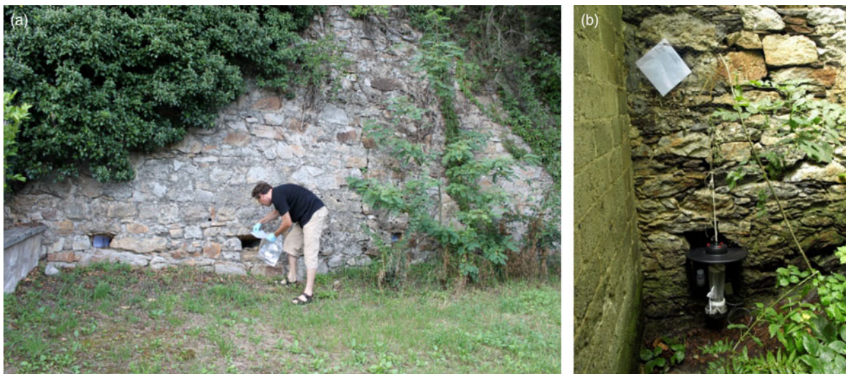
Fig. 7 P. mascittii habitat in (a) Alsace, France and (b) Ticino, Switzerland; combination of light and sticky traps.

inside houses or under leaves. Resting site collections may be the best method for obtaining male sand flies, which are required for the identification of some species. Generally there are no differences between trapping techniques but some modification according to resting place may be needed.