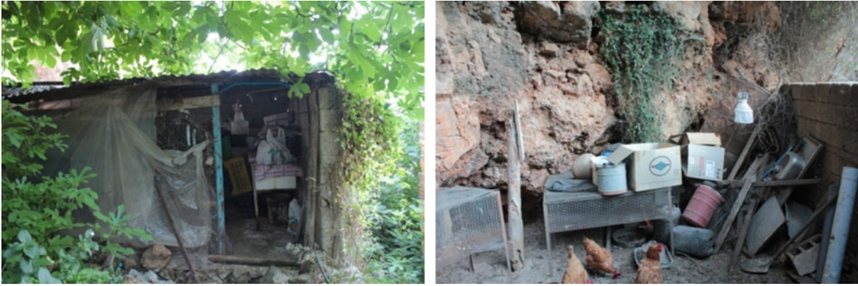
Fig. 3. P. similis habitat in Crete.

plaster-lined pots containing some suitable larval diet. This method has the advantage of preserving the larvae alive so that they can be reared to adults, this being of critical importance in areas where more than one sand fly species occurs, because specific identification of immature stages is generally impossible.