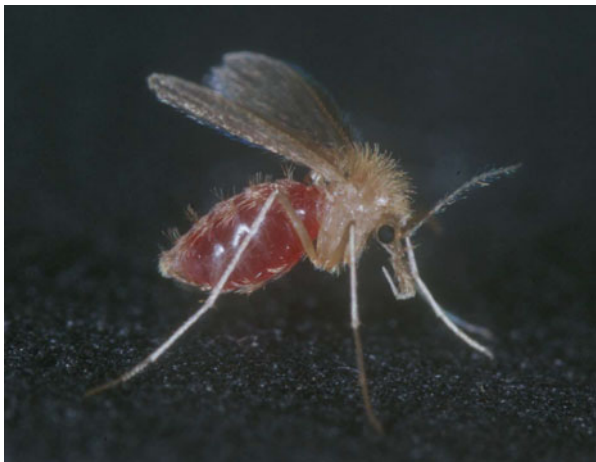
Fig. 9. Phlebotomus papatasi female.

many cases obsolete) written keys in the literature, and some of them are on local sand fly fauna for studied countries and/or studied area(s). In fact, for most of the sand fly species, morphological identification is very difficult and needs experience, particularly for female specimens. The taxonomy is not always resolved and there are important gaps in our knowledge. In many cases, morphological identification using written keys is not sufficient, and molecular confirmation is additionally required. The best approach is to conduct a morphological identification and then to use molecular methods for confirmation. Even if most sand fly species can be distinguished morphologically it requires expertise to discern these differences. For instance, it is difficult to distinguish P. perniciosus from Phlebotomus longicuspis (Pesson et al. , 2004) or Phlebotomus neglectus from Phlebotomus syriacus (Badakhshan et al. , 2011; Erisoz Kasap et al. , 2013). For damaged specimens and immature stages, molecular methods will be required for accurate identification.