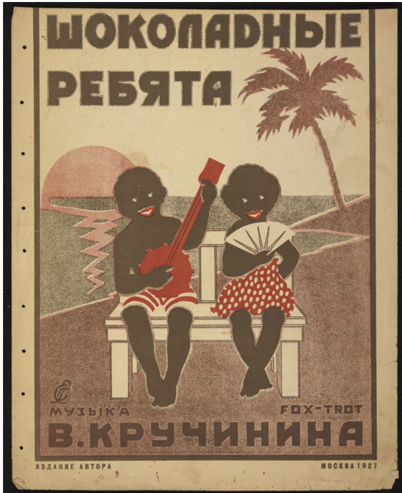
Figure 1 Front cover of Valentin Kruchinin's 'Shokoladnyye rebyata' ('Chocolate Kiddies'). Moscow: Izdanie avtora, 1927.

music to the status of high art. 37 But in autumn 1923, eccentric dances, foxtrots in particular, began to face a severe backlash, particularly by the Proletkult press and by cautious political