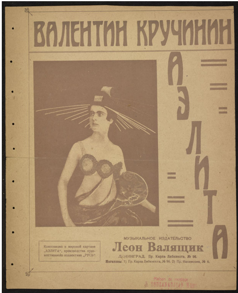
Figure 2 Front cover and score for Valentin Kruchinin's 'Aelita' (3 pages). Leningrad: Muzykal'noye izdatel'stvo Leon Valyashchik, undated.

'striding' left-hand figures, all allusions to American ragtime piano technique. This said, the piece's formal generic identity is vague. Valyashchik's official label for the work was 'choreographic sketch' ( khoreograficheskiy eskiz ), as can be seen on back-page advertisements from this period that promoted other Kruchinin scores (Figure 3). The term 'choreographic sketch' seems a rather broad one, used to merely distinguish sung works (romances and songs) from instrumental works meant for dance. One common element among Valyashchik's list of choreographic sketches is the use of evocative titles; Kruchinin's 'Jungle' ( Dzhungli ), 'Baby' ( Babi ), and his tango 'Vampire' ( Vampir ) are useful examples. In practice, a choreographic sketch could thus be any programmatic piano work, either for use in public entertainment (e.g., dance studios, clubs, restaurants) or home enjoyment. Several of Kruchinin's eccentric dances fall under this umbrella categorization, including his foxtrots 'Jackie' ( Dzhekki ) and 'Indian Summer' ( Bab'ye Leto ).