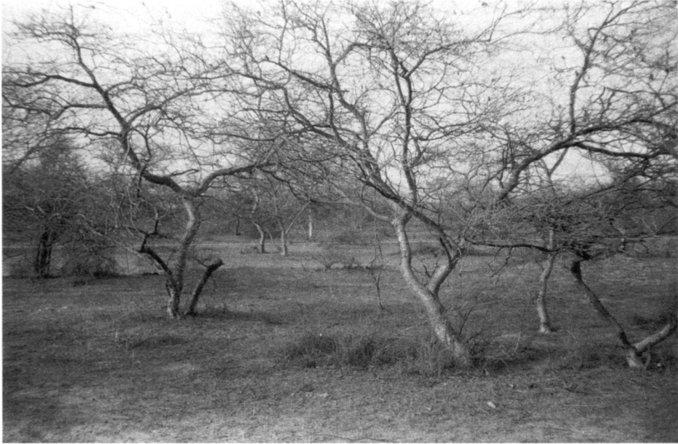
Plate 2. Typical habitat of the White-winged Black Tit at Jathaveera/Fulay, Kachchh.