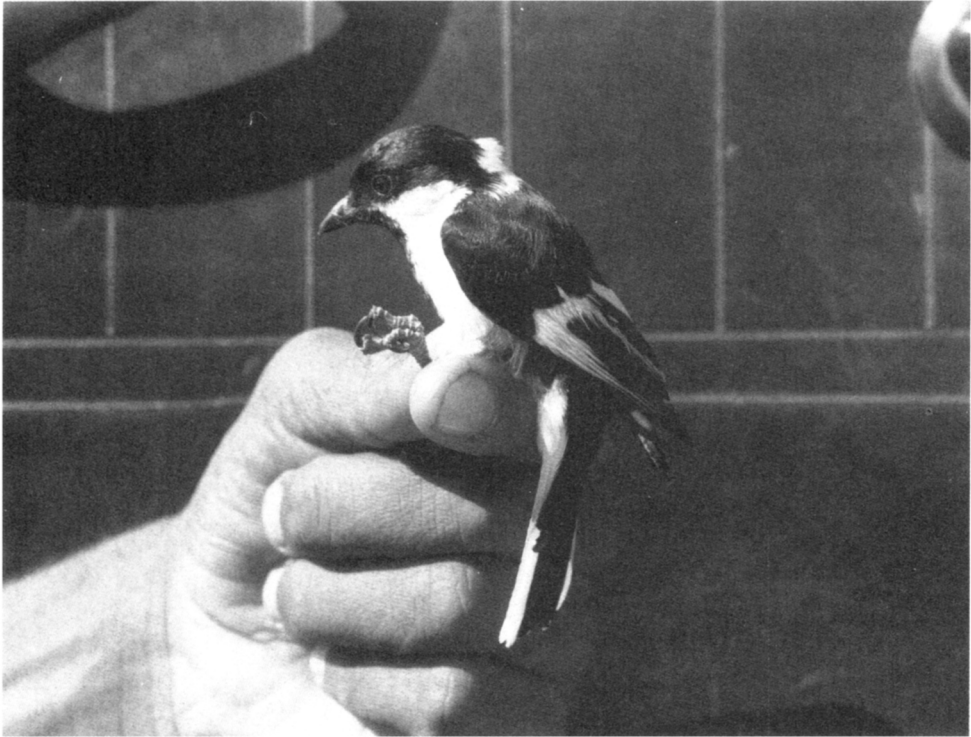
Plate 1. White-winged Black Tit.