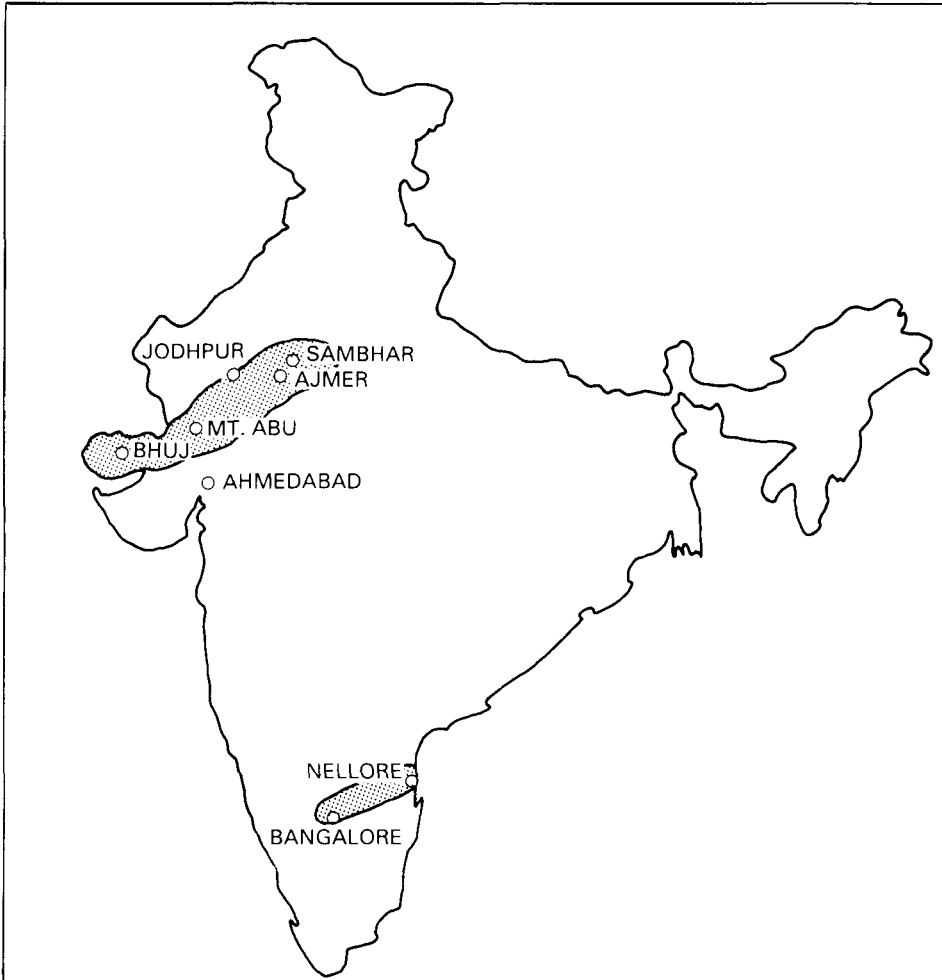
Figure 1. Distribution of White-winged Black Tit Parus nuchalis in India.

made for the Bombay Natural History Society (BNHS) between January 1990 and March 1991.