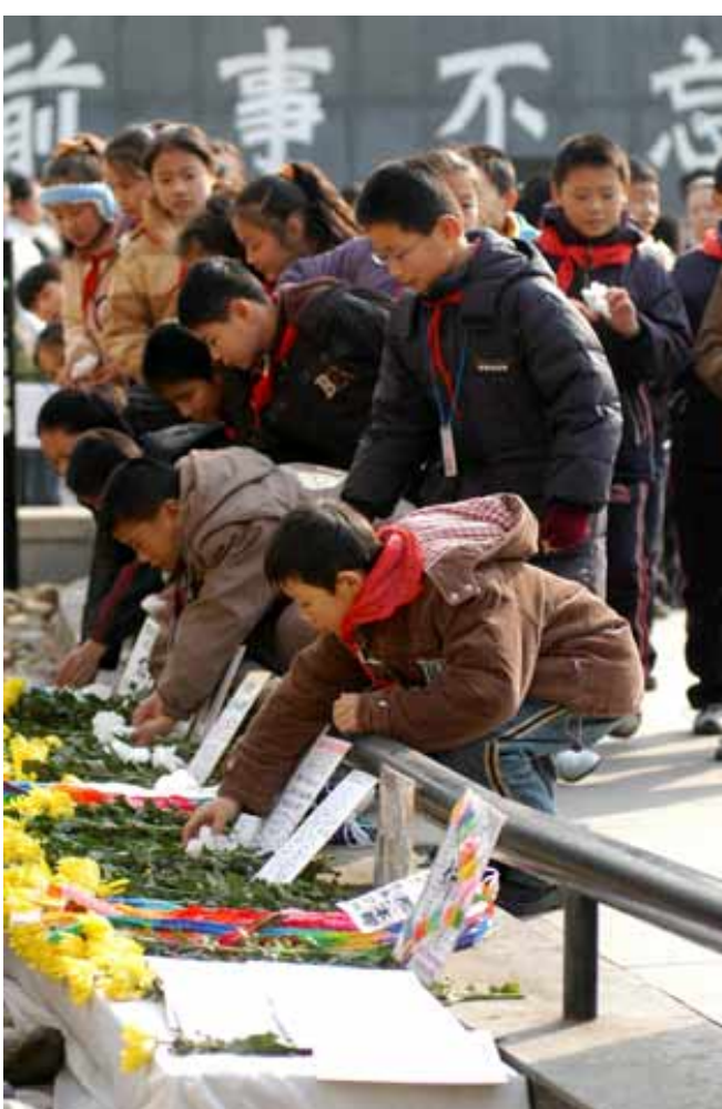
Chinese students place flowers in front of a monument for victims during a gathering marking the 68th anniversary of the Nanjing