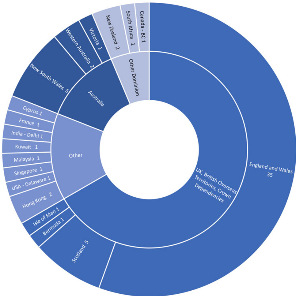
FIGURE 2. Traveling Judges by Home Jurisdiction Excluding Non-Commercial ECSC and The Gambia—June 2021

If one focuses only on the courts in our study most oriented to international commerce, 135 the traveling judges look more like their colonial antecedents. Eighty-three percent are from the UK and long-term Dominions (Australia, Canada, New Zealand, and South Africa). The AIFC courts in Kazakhstan have 100 percent English judges. The rest of our discussion will focus primarily on the judges in Figure 2 .