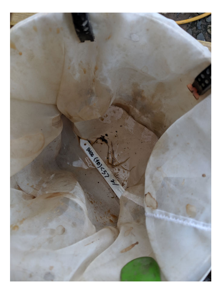
Figure 2. Image of light fraction in a fine mesh sieve bag.

Historically, weed ecological research in archaeobotany (like ecological research in general) could be divided into two approaches: the autecological approach and the synecological approach. Autecology focused on the behavior of individual species. Synecology, also referred to as phytosociology, focused on plant communities as a whole. Using the presence or absence of key diagnostic species known to have narrow ecological ranges, archaeobotanists would be able to interpret entire weed communities to make inferences about the environments in which these communities might have been formed. For a more detailed discussion of the differences between these two approaches, see van der Veen (1992).