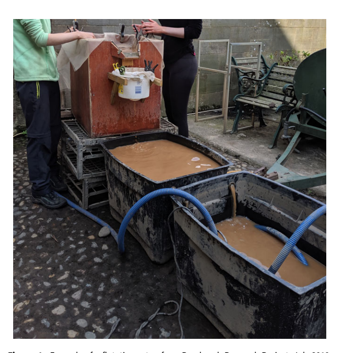
Figure 1. Example of a flotation setup from Bamburgh Research Project, July 2019. The mesh is placed in the wooden tank and water is recirculated through two black settling tanks.

small weed seeds that would be otherwise overlooked. As smaller weed seeds began to be recovered in greater numbers with flotation, archaeobotanists began to study them in greater detail.