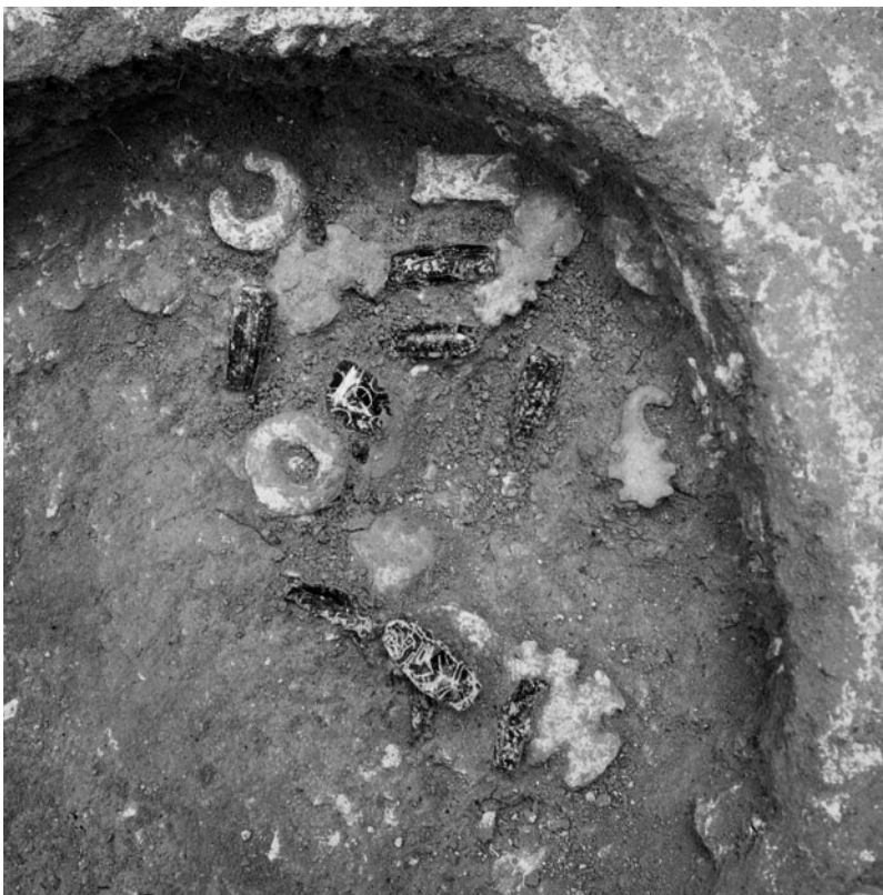
Figure 3. Tikal's cache 95, Bool B Cache Complex (courtesy of the Penn Museum, Tikal Project image No. 60-4-487).

In short, it's important to observe a whole range of criteria when grouping caches into meaningful complexes: their content, layout, repository, stratigraphic position, associated structure types, architectural groups, and chronology (Table 1). But as the statistics that follow will demonstrate, nuances and variations have to be taken into account.