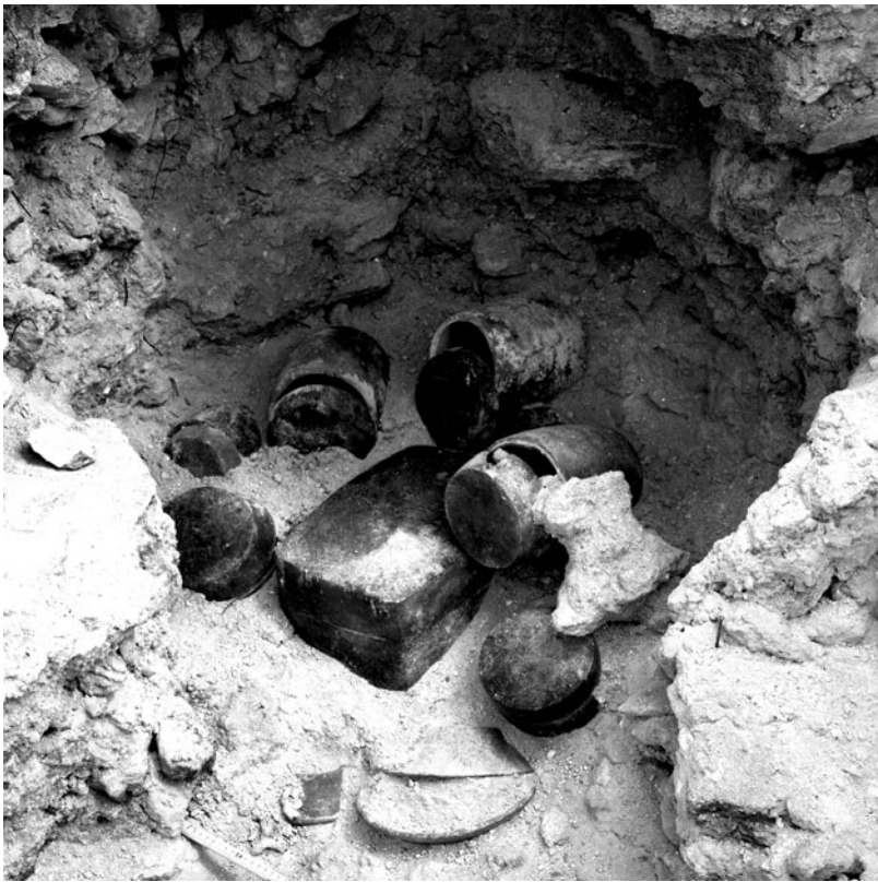
Figure 4. Tikal's cache 119, Acach D Cache Complex (courtesy of the Penn Museum, Tikal Project image No. 61-4-605).