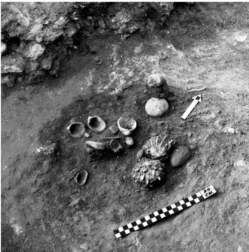
Figure 2. Tikal's cache 63, Leum Cache Complex (courtesy of the Penn Museum, Tikal Project image No. 60-25-36).

Overall, the more a complex is characterized, the more it stands out clearly from the others. Some are immediately recognizable because they combine a number of strong identification criteria that are specific to