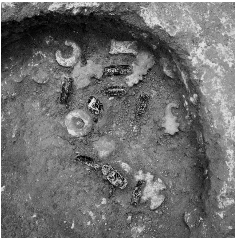
Figure 3. Tikal's cache 95, Bool B Cache Complex.

In short, it's important to observe a whole range of criteria when grouping caches into meaningful complexes: their content, layout, repository, stratigraphic position, associated structure types, architectural groups, and chronology (Table 1). But as the statistics that follow will demonstrate, nuances and variations have to be taken into account.