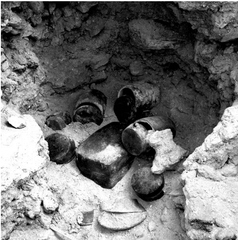
Figure 4. Tikal's cache 119, Acach D Cache Complex (courtesy of the Penn Museum, Tikal Project image No. 61-4-605).