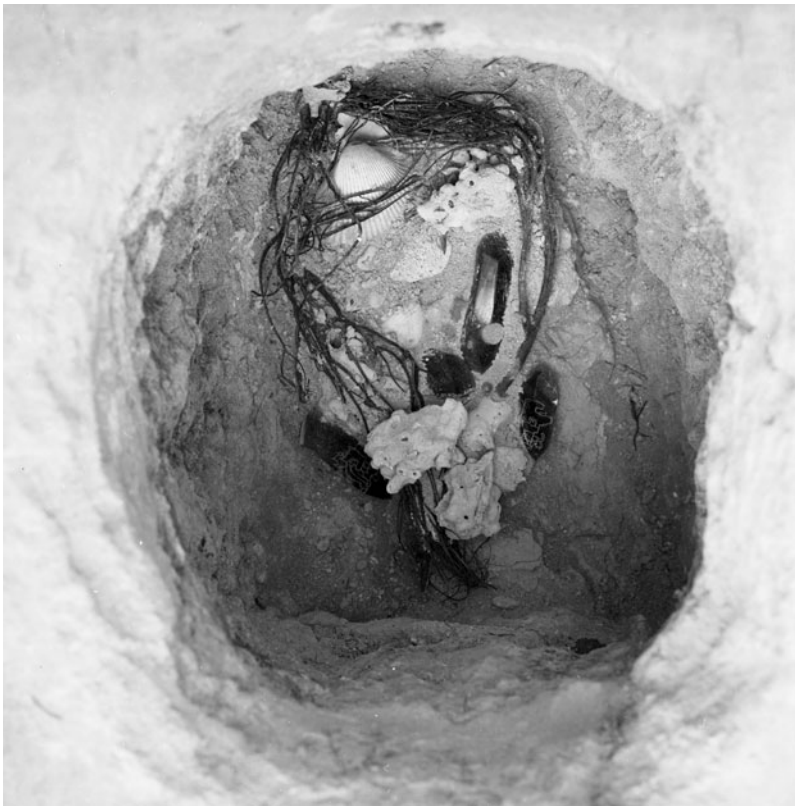
Figure 5. Tikal's cache 131, Uz B Cache Complex (courtesy of the Penn Museum, Tikal Project image No. 65-4-14).

buildings and basal platforms. As with the vessel complexes family, there may have been filiations. Indeed, the typology of sets is mainly based on stylistic variations of the same forms (Moholy and Coe 2008:Appendix 11). Be that as it may, the standardization and specialization of lithic complexes are clearly visible in the Late Classic period, when they multiply (mostly below stelae), in contrast to the vessel complexes that flourished in the Early Classic. The other eight complexes, which do not belong to either of these two families, are spread across the entire chronology.