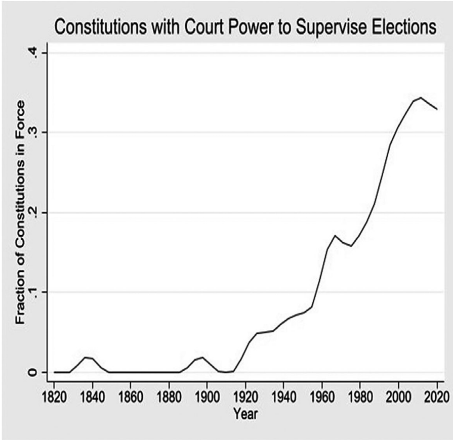
FIGURE 10.1 Percentage of extant constitutions with courts engaged in electoral supervision.

management body.* They show how the adoption of courts preceded that of election commissions globally by about twenty years and, further, how neither model is obviously numerically dominant. The choice between courts and fourth-branch institutions (if imagined as a matter of substitutes and not as possible complements) hence remains a live one.